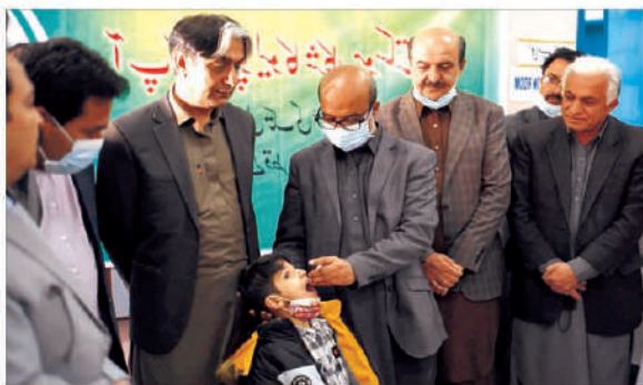
QUETTA: Secretary Health Noor Ul Haq Baloch administering polio drop to child during inauguration polio campaign in provincial city.