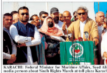
KARACHI: Federal Minister for Maritime Affairs, Sved Ali Haider Zaidi talking to media persons about Sinrh Rights March at toll plaza Karachi.