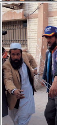
QUETTA: People shifting dead body of police personnel at civil hospital after unknown person open fire on police at east bypass.