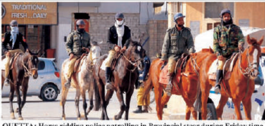
QUETTA: Horse riding police patrolling in Provincial steer during Friday time.