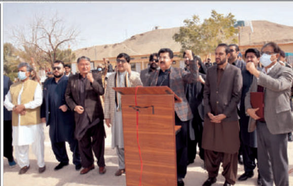
Chairman Senate Muhammad Sadiq Sanjani and Chief Minister Balochistan Mir Abdul Qudus Bizenjo visit FC camp in Nauskhi, Balochistan.

Security forces foil nefarious designs of enemy: Governor Balochistan