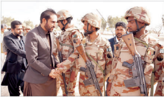
Noshki, Balochistan Chief Minister Mir Abdul Qudous Bizenjo shakes hands with soldiers on the occasion of his visit to FC Camp Noshki.