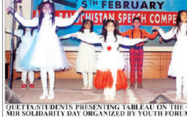
QUETTA STUDENTS PRESENTING TABLEAU ON THE OCCASION OF KASHMIR SOLIDARITY DAY ORGANIZED BY YOUTH FORUM FOR KASHMIR.