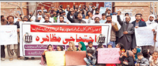
QUETTA: ACTIVISTS OF NOJAWAN ACTION COMMITTEE HOLD PROTEST IN FAVOR OF THEIR DEMANDS OUTSIDE OPC

ISLAMABAD: After more than a month of recording historic-high cases, Pakistan is finally seeing a decline in the trend of coronavirus infections. On Sunday, the national positivity rate fell to 8.7%.