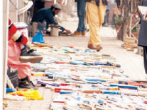
RAWALPINDI: People are busy in buying old books at Sadar area in the City.

ISLAMABAD: The Islamabad Traffic Police (ITP) campaign launched to check lane violation is in full swing and issued 7666 fines to drivers during last one month and also road users are being educated to follow traffic rules and minimize the accident rate.