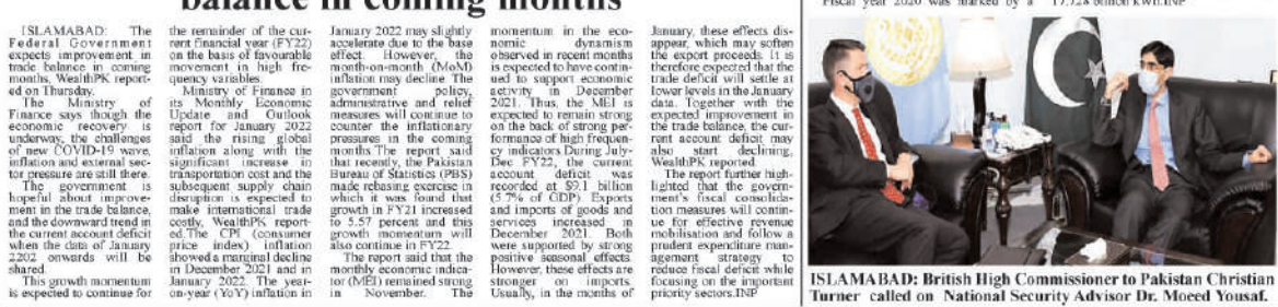
ISLAMABAD: British High Commissioner to Pakistan Christian Turner called on National Security Advisor Dr. Moeed Yusuf.