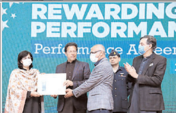
ISLAMABAD: Prime Minister Imran Khan awards performance certificate to SAPM on Poverty Alleviation Dr. Sania Nishtar.