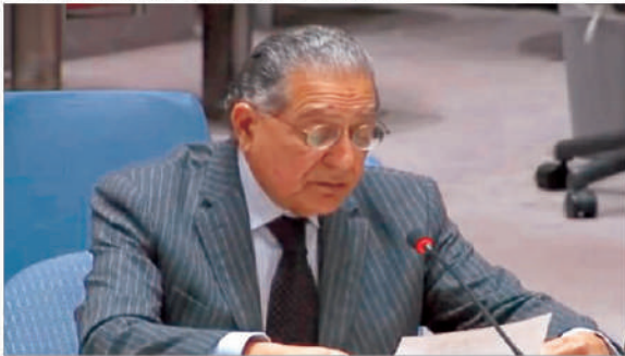
NEW YORK: Ambassador Munir Akram, Permanent Representative of Pakistan to the United Nations, delivering statement during the United Nations Security Council briefing on United Nations Assistance Mission in Afghanistan (UNAMA).

Qureshi recalled that Prime Minister Imran Khan had reiterated the larger situation between Russia and Ukraine, and had shared Pakistan's hope that diplomacy could avert military conflict.