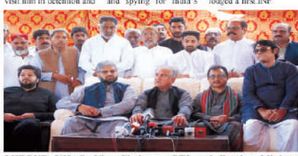
MIRPUR KHAS: Vice Chairman PTI and Foreign Minister Makhdoom Shah Mahmood Qureshi held a media talk at Mirpur Khas.

LAHORE: Punjab Chief Minister Sardar Usman Buzdar has given in-principle acceptance to recruit 4662 watch and ward officials of the prisons department and announced to provide 22 ambulances for the prisoners' repatriation from jail hospitals to other institutions in the first phase while 21 ambulances would be given next year. While chairing a meeting to review the progress of jail reforms, this was also attended by Minister for Prisons Fayyaz-ul-Hasan Chohan, ACS (Home), IG prisons and other officials. The Punjab Prison Staff Training College in Sahiwal along with the construction of additional barracks in ten different jails, Usman Buzdar directed to establish more POs to help prisoners to contact their families and added that juvenile offenders and impecunious prisoners would be provided with this facility free of cost. Meanwhile, the Akiwau would provide loans to officials of the prisons department for building houses. While directing to accelerate recruitment of watch and ward staff, the Akiwau would provide quality items at jails canteens at DC rates and made it clear that jail superintendent would be prosecuted over complaints of over-charging or substandard items.