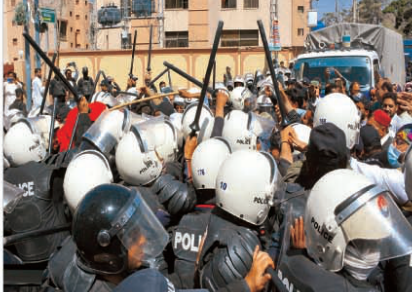
QUETTA: A view clash between police and Balochistan Employees and Workers Grand Alliance during a protest.