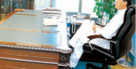
ISLAMABAD: Federal Minister for States and Frontier Regions (SAFRON) Sahibzada Mehboob Sultan called on Prime Minister Imran Khan.

Meanwhile, former league opposition in the NA and PPP MNA Syed Khurshid Ahmed Shah said he has no objection if the ruling party stops its MNAs from attending the public meeting of the no-trust motion. "Prime Minister Imran Khan would start a civil war in the country," he alleged. INP