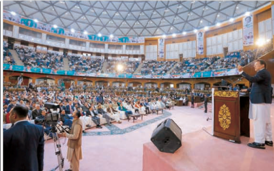
ISLAMABAD: Prime Minister Imran Khan addressing at Pakistan Overseas Conference in Federal Capital.