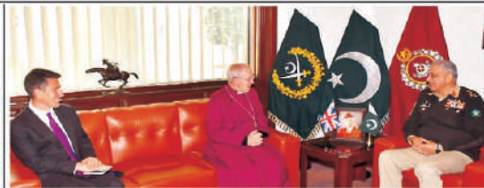
RAWALPINDI: Honorary Justin Welby, Archbishop of Canterbury (ABC), Head of the Church of England and His Excellency Doctor Christian Turner, British High Commissioner called on General Qamar Javed Bajwa, Chief of Army Staff (COAS) at GHQ.