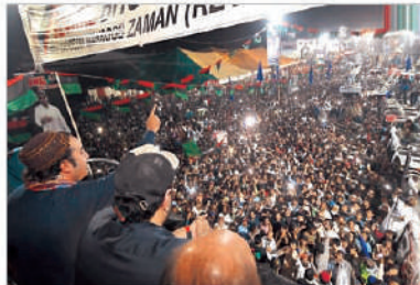
HALA: Chairman Pakistan People Party Bilawal Bhutto Zardari addressing the participant's of Long march.

The passenger bus and the truck were severely damaged in the collision. Road accidents have claimed thousands of precious human lives in Balochistan. Reckless driving and narrow roads are the main cause of the increasing number of traffic accidents on national highways linking Balochistan with the rest of the country.