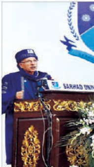
ISLAMABAD: President Dr. Arif Alvi addressing the 14th convocation of the Sarhad University of Science & Information Technology Peshawar.