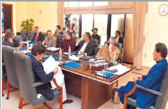
ISLAMABAD: Prime Minister Imran Khan chairs 4th meeting of Board of Governors of Special Technology Zones Authority (STZA).