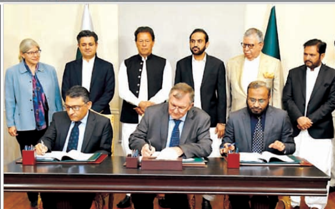
Prime Minister Imran Khan, CM Balochistan, Mir Qudus Bizenjo and others witnessing the agreement signing ceremony about Reko Diq Project