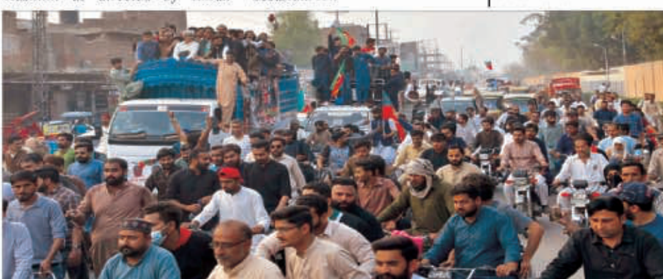
FAISALABAD: Special Assistant to the Prime Minister for Political communication Dr. Shahbaz Gill led by a PTI rally in connection with showing solidarity with Prime Minister Imran Khan at Jail Road in the City.