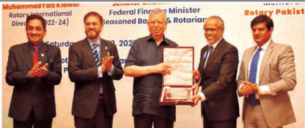
KARACHI: Finance Minister Finance & Revenue Shaukat Tarin is being presented with memento during the signing ceremony of MoU between Rotary Pakistan and Saylani Welfare Trust.