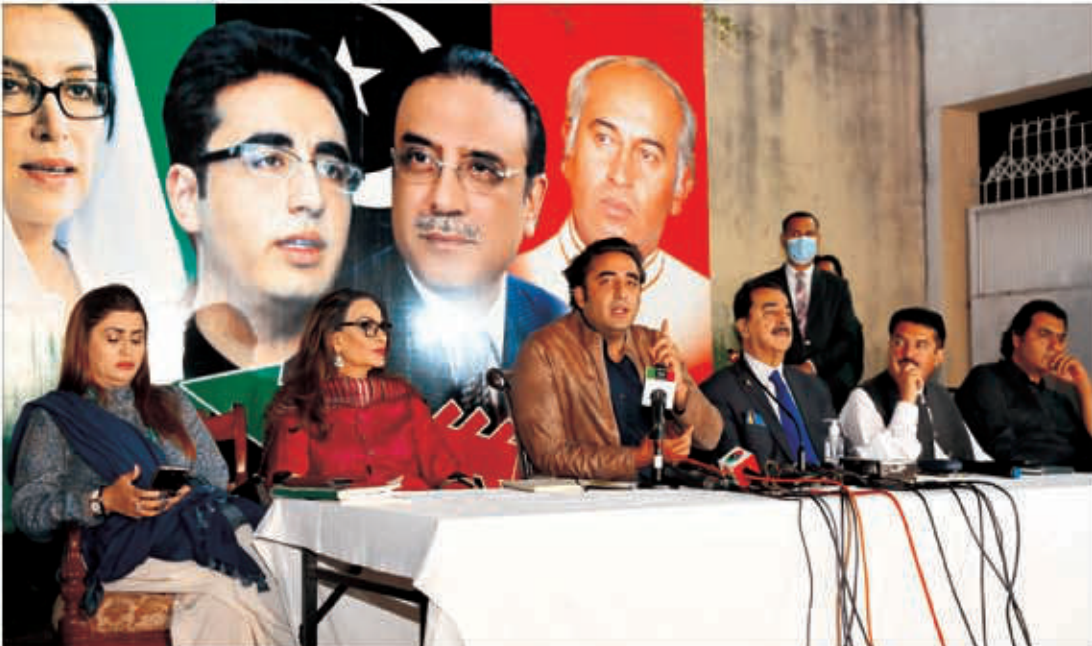
ISLAMABAD: Chairman Pakistan People's Party Bilawal Bhutto Zardari addressing a Press Conference at Zardari House, in Federal Capital.

tion to a petition filed by the Supreme Court Bar Council (SCBA) seeking the SC's intervention to prevent "anarchy" ahead of the no-confidence vote against the premier. The Supreme Court had on Saturday issued notices to four political parties — PTI, PML-N, PPP and JUI-F — in connection with a petition filed by the SCBA. The SCBA, in its petition, had demanded that officials tasked with the responsibility to maintain law and order in Islamabad must "prevent any assembly, gathering, public meetings and/or processions that could hamper the assembly proceedings or participation of members in the session". It had also sought the court's directions for all state functionaries "to act strictly in accordance with the Constitution and the law and they be restrained from acting in any manner detrimental to and unwarranted by the Constitution and the law." Bilawal said no political party was a party to the SCBA's petition, however, "I commend that the court gathered on a weekend on Saturday and issued notices while hearing this important plea." The PPP leader said he had not thought that the government would move to "violate" the Constitution. "The government is now sensing its defeat and it is now making unconstitutional attempts." He also alleged that the prime minister was hoping that the "neutrality status" of the establishment underwent a change. He said the opposition wanted one of the ISPR or the top court to take notice of the prime minister's "campaign". Web Desk