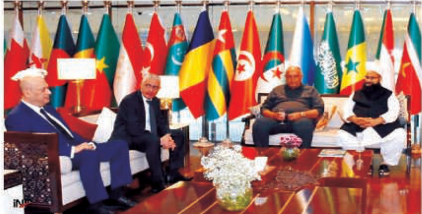
ISLAMABAD: Egyptian Foreign Minister arrived at Islamabad airport.