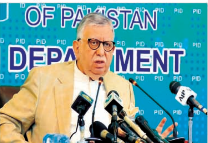
ISLAMABAD: Federal Minister for Finance and Revenue Mr. Shaikat Tarin addressing a press conference.

CHITRAL: A man was fined Rs150,000 by the Chitral Wildlife Division for an attempt to illegally hunt Markhor in Tooshi Game Reserve on Sunday. According to the official sources, the community watchers of the Chitral Wildlife Division caught the person who was attempting to illegally hunt Markhor in Tooshi Game Reserve and fined him Rs150,000.