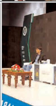
Prime Minister Imran Khan addressing at Islamabad Security Dialogue, Islamabad.