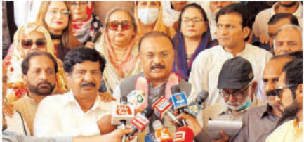
MULTAN: Special Assistant to the Prime Minister on Political Affairs and Chief Whip, Malik Muhammad Amir Dogar talking to media at Radio Pakistan.

of the attacks took place in Khyber Pakhtunkhwa (KP), followed by east Khyber Pakhtunkhwa (Balochistan districts of KP) and Balochistan. PICSS has recorded nine militant attacks in KP in which 77 people were killed, including 12 security forces personnel, four militants, and 62 civilians, while 216 people were injured, including 27 security forces personnel and 189 civilians. In east Khyber Pakhtunkhwa, 12 people got injured, of which eight were security forces personnel and four were civilians. In Balochistan, six militant attacks were witnessed in which 1NP