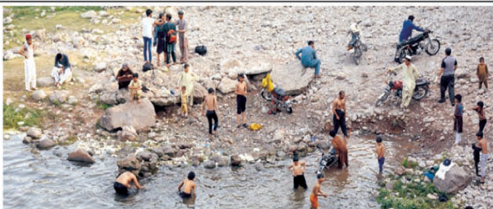
ISLAMABAD: People are swimming and bathing in Rawal Dam to get relief from hot weather in the city.

to which the Prime Minister is committed. Mian Zahid Hussain further said that the Prime Minister should announce the cabinet as soon as possible and the most qualified people should be given the ministry of finance and energy as the future of the country is in the hands of these two ministries. The Ministry of Energy and Petroleum should be kept under one person so that matters can move forward smoothly and ministers should not get involved in disputes between important ministries like the previous government. The fiscal deficit, which was estimated at Rs3420 billion, is approaching Rs5550 billion which is causing worries. Pakistan has the weakest economy in the region after Sri Lanka. Sri Lanka has officially gone bankrupt and if the previous government was allowed to work for a few more months Pakistan would have officially gone bankrupt, he said. INP