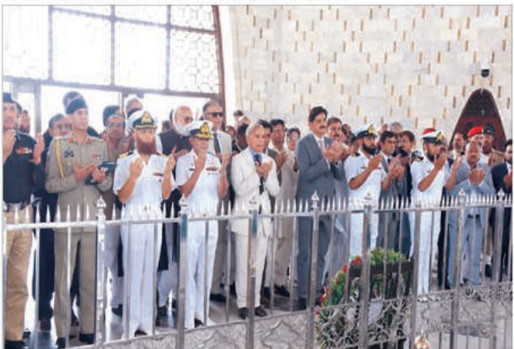
KARACHI: Prime Minister Shehbaz Sharif offers Fateha at Mazar-e-Quaid.

Governor Punjab, Usman Buzdar discuss political situation, election of new CM. LAHORE: Punjab Governor Omar Sarfraz Cheema and former chief minister of the province Usman Buzdar held meeting at Governor House Lahore on Wednesday and discussed the current political situation and the election of a new chief minister of Punjab. Talking on the occasion, Omar Sarfraz Cheema said that Chaudhry Pervaiz Elahi is the party's nominee for Punjab Chief Minister. INP