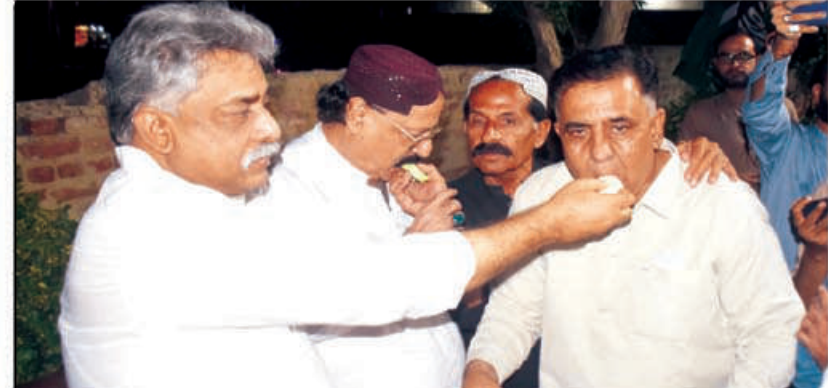
HYDERABAD: PPP Adviser to chief minister Hyderabad Sagheer Ahmed Qureshi celebrating the victory of PML-N President Mian Muhammad Shahbaz Sharif after being elected as new Prime Minister of Pakistan at makrani para.

Islamabad: Researchers have known about the pain relieving potential of cannabis for decades, but they have had to wait until now to determine how the plant creates such effective substances. Their findings may help provide a solution to the opioid crisis. People can treat chronic pain using a number of different medications. However, doctors commonly prescribe opioids for pain that is constant. Opioids work by attaching themselves to nerve cell receptors in various parts of the body, blocking pain signals that are traveling to the brain. Although effective, the downside of opioids is the risk of addiction — especially when a person takes them for an extended period. More than 130 people in the United States die of an opioid overdose each day, according to the National Institute on Drug Abuse. The problem is so severe that officials have labeled it as a public health crisis. "There's clearly a need to develop alternatives for relief of acute and chronic pain that go beyond opioids," says Prof. Tariq Akhtar, from the department of molecular and cellular biology at the University of Guelph in Ontario, Canada. According to Prof. Akhtar and other researchers at the university, cannabis could be the key. INP