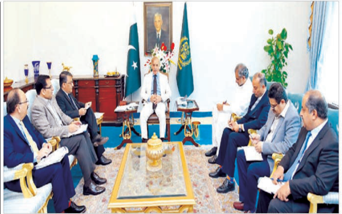
ISLAMABAD: Prime Minister Shehbaz Sharif chairs a meeting on Energy sector.