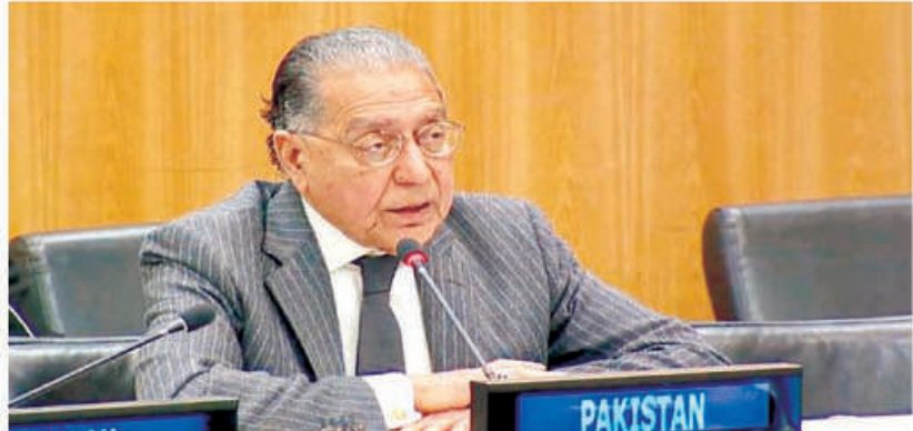
NEW YORK: Ambassador Munir Akram, Permanent Representative of Pakistan to the UN, during the member states briefing on the UN 2023 water conference, by permanent mission of Tajikistan and Netherlands.

LAHORE: The Punjab authorities have been considering a proposal to provide free transport facility of Orange Line Metro Train (OLMT) to the school children in Lahore, it was learnt on Wednesday. In the first phase, 200,000 children will be issued travel passes. The metro authorities sought the proposals and recommendations in this regard from the school administrations. The metro pass to students could be availed to go and come back from the school. Orange Line is an automated rapid transit line in Lahore being operated by the Punjab Mass Transit Authority. INP