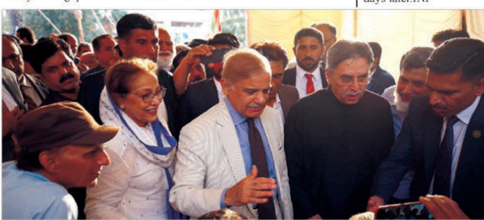
KARACHI: Prime Minister Shehbaz Sharif visiting MQM-P markaz bahadabad.

The business leaders said that a sustainable economy requires a lot of time but for this it is necessary that we make progress without any delay starting from today and the government should take extraordinary decisions to develop the economy. They further hoped that the new Prime Minister and his economic team would continue their tireless efforts for the economic development and prosperity of the country and all stakeholders will be taken into confidence in formulating policies related to trade and economy so that the positive results of these policies can be seen. INP