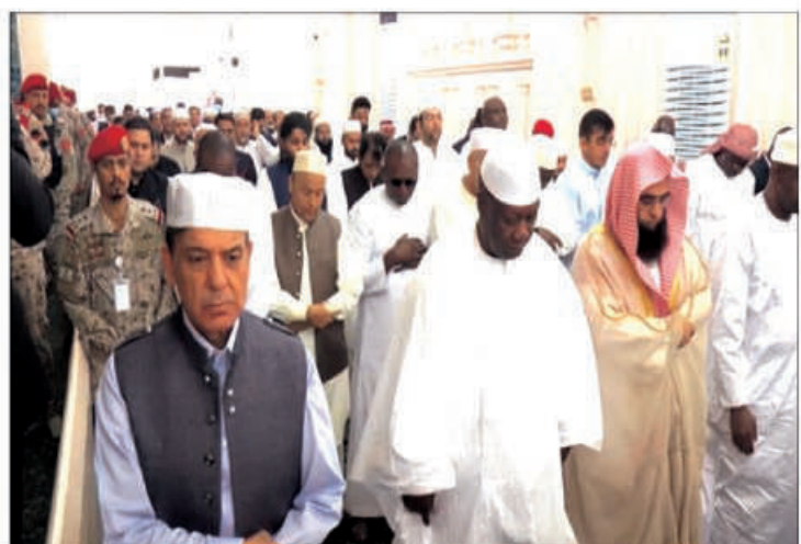
MADINA: Prime Minister Shehbaz Sharif offers Jumma Prayer in Masjid-e-Nabwi (PBUH), Madina.

A few days ago, former interior minister Sheikh Rashid has given a hint regarding the happening of this shameful act during a press conference. "See what the people will do (to PM and his companions) when they reach there for Umrah," he told the media. It is pertinent to mention here that Sh Rashid has recently come back from Saudi Arabia after performing Umrah there during which he also visited Madinah. The former aide to ex-PM Imran Khan, Maulana Tahir Ashrafi who is also part of incumbent Premier Shehbaz's Umrah entourage condemned the incident, stressing such acts must be stopped. "I strongly condemned such an act and use of immoral and unethical words at the holy place. INP