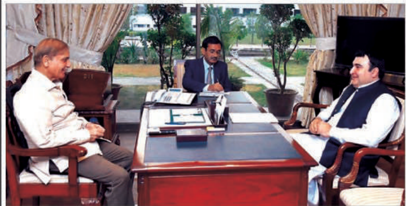
ISLAMABAD: Deputy Speaker National Assembly Zahid Akram Durrani calls on Prime Minister Shehbaz Sharif.

He said the campaign Imran has launched to discredit and sow discord in the institutions is dangerous for the security of Pakistan and will benefit the enemy forces. He said that Pakistan Army is not only the protector of Pakistan's borders but its responsibility is also to protect the constitution.INP