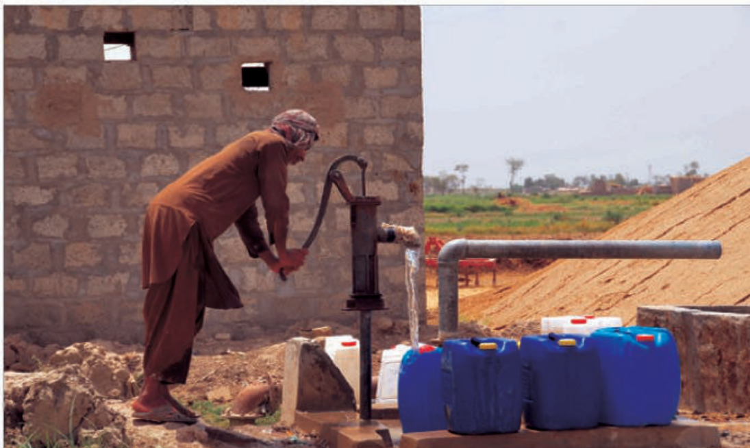
DERA ALLAH YAR: A man is filling pure water in cans from roadside null, far away from his house due to the shortage of water during the hot summer season in City.