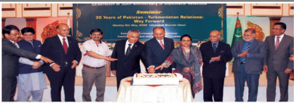
ISLAMABAD: Minister of State Musadik Masood Malik cutting the cake along with Ambassador of Turkmenistan to Pakistan Atadjan Movlamov during the celebrations of the 30th Anniversary of Diplomatic Relations of Turkmenistan and Pakistan, as Organized by Institute of peace and Diplomatic Studies at local hotel in Federal Capital.

currency which lifted the cost of imported products and created uncertainty about the exchange rate stability. The dollar was at Rs164 in October 2020 and now again hovering in the range of Rs186 in May 2022.