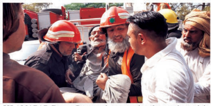
ISLAMABAD: Rescue Personnel are rescuing the people stuck in a building as fire engulfed a tower in blue area with short circuit, in Federal Capital.

respectively. The price of Swift GLX CVT has been increased by Rs129,000 to Rs3298,000. he new prices of Bolan Van and Bolan AC are now stand at Rs1328,000 and Rs1415,000, respectively. Furthermore, the price of Bolan Cargo has risen to Rs1315,000. The prices of Ravi and Ravi without Deck have increased to Rs1256,000 and Rs1181,000, respectively. The prices of Swift GL MT and Swift GL CVT have also witnessed a hike to reach Rs2774,000 and Rs2998,000, respectively. The price of Swift GLX CVT has been increased by Rs129,000 to Rs3298,000. he new prices of Bolan Van and Bolan AC are now INP.