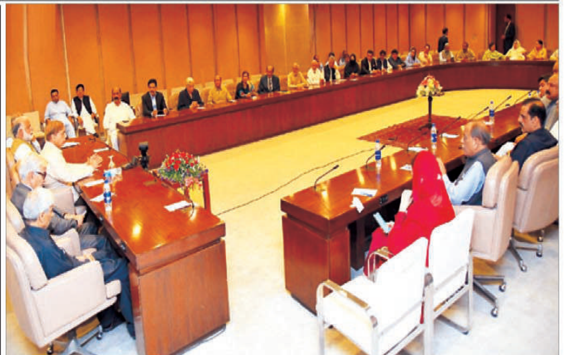
ISLAMABAD: Prime Minister Shehbaz Sharif chairs PML-N Palimentary party meeting.

adding that if even 20 per cent to 30pc of that support was provided to the PPP or PML-N governments then "we would have had this country [taken] off as a plane flies." The prime minister reiterated that if Imran's comments were not clamped down on then "nothing would be left" and there would be a crisis in the country. He lambasted the PTI chairman for taking the country in a direction where democracy could be eliminated. PM Shehbaz also criticised the PTI government on economic fronts such as arranging oil and gas supplies, maintaining power plants, managing the fiscal deficit and taking loans. He said it had "mortgaged future generations" with the number of loans it had taken. The prime minister also rubbished Imran's claims about the Cablegate affair and said Pakistan's then-ambassador to the US had himself admitted that threatening language was used in the letter but "where was this element of conspiracy conjured from?" Web Deskss