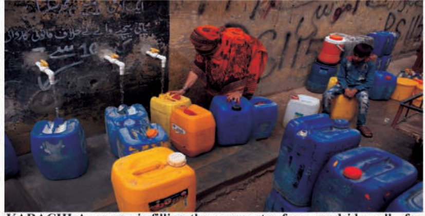
KARACHI: A woman is filling the pure water from roadside null, far away from her house as Some areas of the city are suffering from acute shortage of water during the hot summer season in Provincial Capital.

Nawabshah-Rohri section (183km), Multan-Lahore section (339km), Lahore-Lalamusa section (132km), Kaluwal-Pindora section (52km) and upgradation of the Walton Academy Lahore. Under Package-II, $2.67 billion was approved for upgradation of Kimari-Hyderabad section (182km) and Hyderabad-Multan section (566km) excluding the work done on Nawabshah-Rohri section in Package-I. Furthermore, under Package-III, the ECNEC approved an amount of $1.42 billion for construction. INP