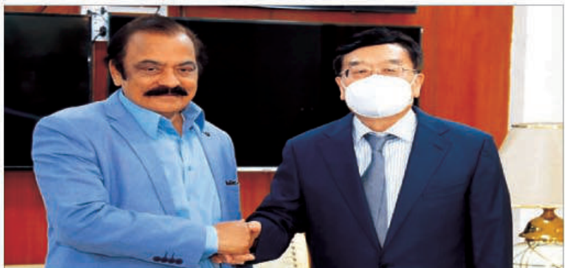
ISLAMABAD: Wang Daxue, Counselor of the Department of External Security Affairs of China shake hand with Federal Minister for Interior Rana Sana Ullah in his office before a meeting held.

Sindh Information and Labour Minister, Saeed Ghani, told media persons that he had come to Islamabad for the signing of an agreement between the Sindh Employees' Social Security Institution (SESSI) and the National Database and Registration Authority. INP