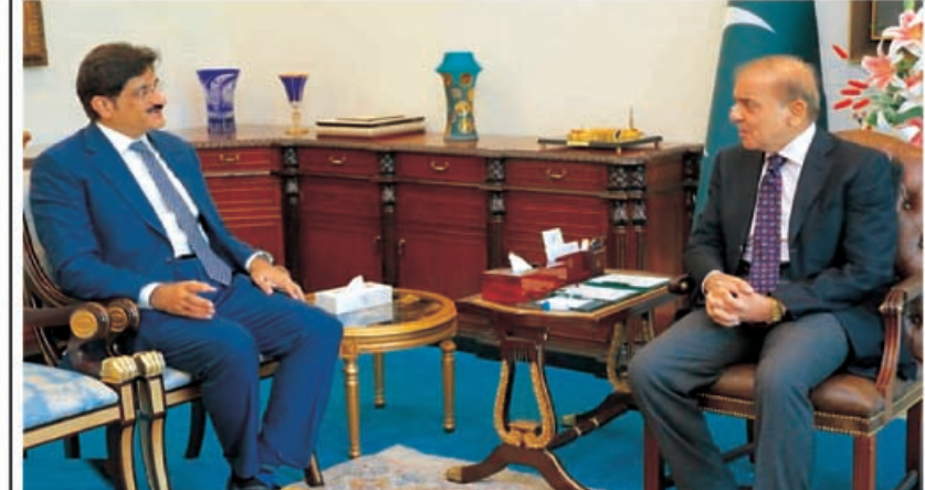
ISLAMABAD: Chief Minister Sindh Syed Murad Ali Shah calls on Prime Minister Shehbaz Sharif.