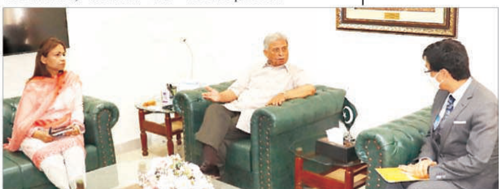
ISLAMABAD: Federal Minister for Federal Education and Professional Training Rana Tanveer Hussain welcomed a delegation of United Nations Population Fund (UNFPA), Pakistan Boy Scouts Association (PBSA) and Aiming change for tomorrow (ACT International).

The reference alleged that the assets were "disproportionate to his known sources of income for which he could not reasonably account for". Online