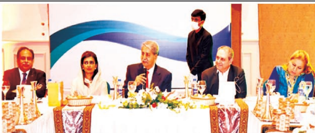
ISLAMABAD: Federal Minister for Commerce, Syed Naveed Qamar, hosting a reception in the honor of EU Delegation to Pakistan and EU Ambassadors in Islamabad.

gation will give a further boost in increasing trend in trade. Minister for Commerce appreciated that many European companies have invested in Pakistan, especially in Agro Food, Energy and Renewable energy sectors. The Minister hoped that many more European companies will get benefit from the ease of doing business initiative of Government of Pakistan. Commerce Minister underlined importance of the GSP Plus scheme for Pakistani economy and particularly for export sector. He emphasized that the scheme helped in promoting universal values and created an enabling environment for implementation of 27 International Conventions in the beneficiary countries besides increasing employment opportunities, especially for women. Syed Naveed Qamar appreciated European member states for their support for Pakistan in securing the GSP Plus status and its continuity in last three reviews conducted by European Parliament and hoped