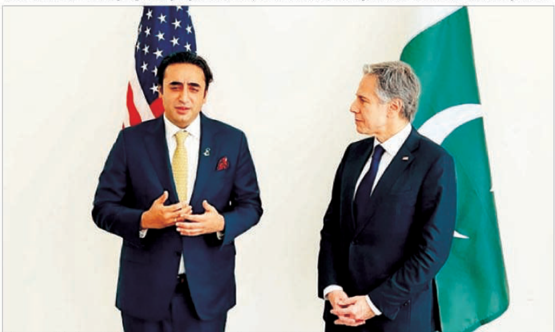
Foreign Minister Bilawal Bhutto Zardari meets US Secretary of State Antony Blinken in New York.

In recent meetings with the new finance minister, the IMF has linked the continuation of its loan programme with the reversal of fuel subsidies, which were introduced by the previous government. However, Prime Minister Shehbaz has multiple times rejected summaries by the Oil and Gas Regulatory Authority and the finance ministry to increase fuel prices. INP