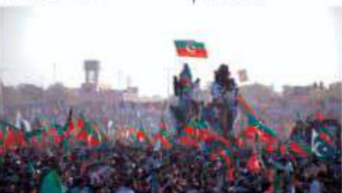
MIANWALI: Sutters of Pakistan Tehreek-e-Insaf hold party flags during PTI public gathering.

In a statement issued here on Friday, she said that after Islamabad's public gathering, PTI will hold power show in Beloon on May 10, in Attock on May 12 and in Sukkot on May 14, 2022.