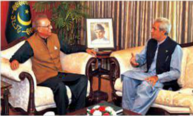
ISLAMABAD: Governor Punjab Umar Sarfraz Cheema, called on President Dr. Arif Alvi at Awwaz-e-Nade.