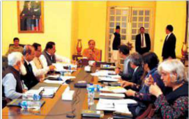
ISLAMABAD: Prime Minister Shehbaz Sharif chairs a meeting to review production, available stock, government and demands of wheat.