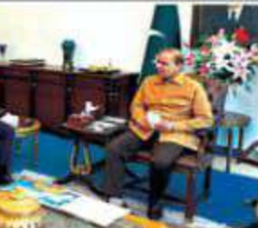
ISLAMABAD: Advisor to the Prime Minister on Kashmir Affairs and Gilgit-Baltistan, Qamar Zaman Kaira, has strongly condemned the state terrorism unleashed by Narendra Modi-led fascist government in Indian illegally occupied Jammu and Kashmir.