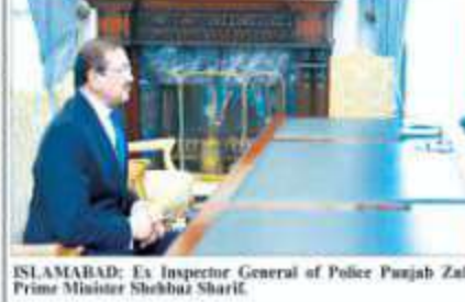
ISLAMABAD: Ex Inspector General of Police Punjab Zulfikar Cheema called on Prime Minister Shehbaz Sharif.

Islamabad: The federal government has decided not to restore the weekly holiday of Saturday as government offices reported 246,540 TV channel. After prime minister's approval, the Federal Election Commission issued a notification in this regard on Friday. However, in an apparent move to compensate the government employees, the government has reduced the office hours on working days. Now the government offices will work from 8:30 am to 3:00 pm. On Fridays, the timings will be from 8:00 am to 1:00 pm. Earlier, the offices were observing time from 9:00 am to 3:00 pm IIP.