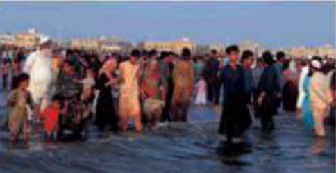
KARACHI: People are enjoying at sea view picnic point on Friday in Provincial Capital.

He said that the government has to take tough decisions to put the crippled economy of the country back on track.