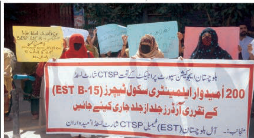
QUETTA: Members of All Baluchistan Elementary School teachers hold a protest in favor of their demands outside press club.