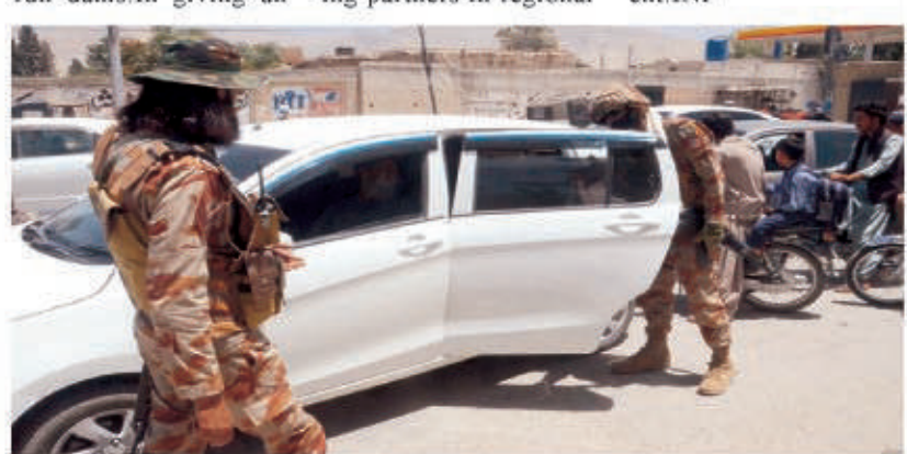
QUETTA Security personals directed to remove tinted papers from vehicles at Saryab Road during high alert security in Provincial Capital.

At the meeting, Foreign Minister Bilawal Bhutto Zardari, Minister for Commerce and Investment Syed Naveed Qamar, and Minister for Information and Broadcasting Marriyum Aurangzeb were present.