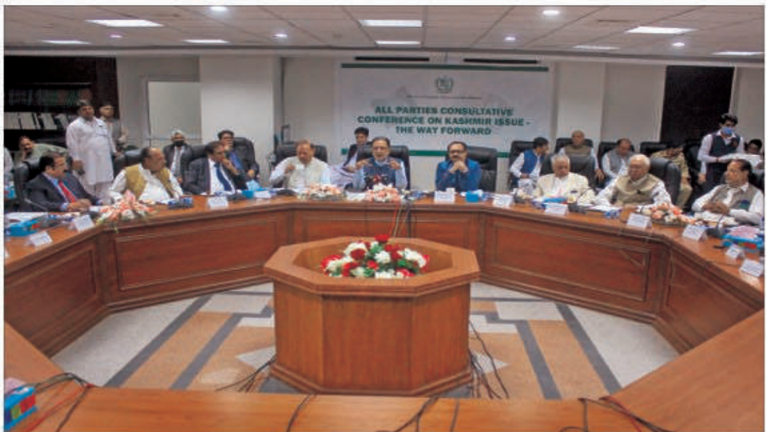
ISLAMABAD: Advisor to Prime Minister Qamar Zaman Kaira addressing during "All Parties Consultative Conference on Kashmir Issue" at Azad Jammu and Kashmir Council Secretariat in Federal Capital.

It has been further recommended to charge Rs945,000 for government-facilitated Hajj while private tour operators will be allowed to charge above Rs1.2 million for the pilgrimage. INP