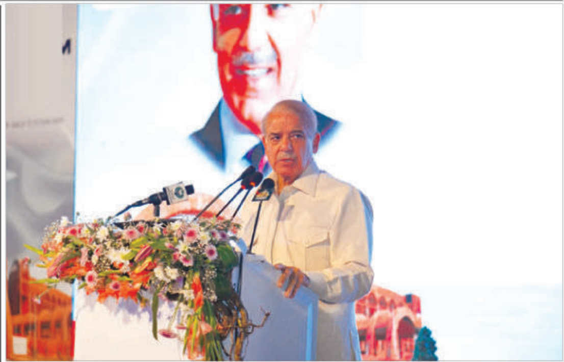
LAHORE: Prime Minister Shehbaz Sharif addressing at the inauguration of Indus Hospital.