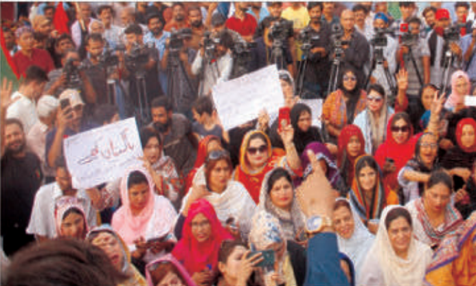
KARACHI: Activists of Pakistan Peoples Party hold a protest n favor of their demands outside press club in Provincial Capital.

KARACHI: Citizens on Sunday arrested a man for allegedly stealing batteries from cars in Karachi's Shadman Town. According to reports, the thief was caught red-handed when he came to steal the battery of a vehicle. The thief was caught red-handed by the residents of area. The furious residents of Shadman Town after subjecting the thief to vicious torture handed him over to the police. It has been learnt that the batteries of the vehicles were being stolen from the area since a long and finally the thief was caught red-handed. Earlier, citizens arrested a man for stealing batteries from parked motorbikes at II Chundrigar Road. As soon as he came to steal another battery in a day, people nabbed him. He was handed over to the police after torture. INP