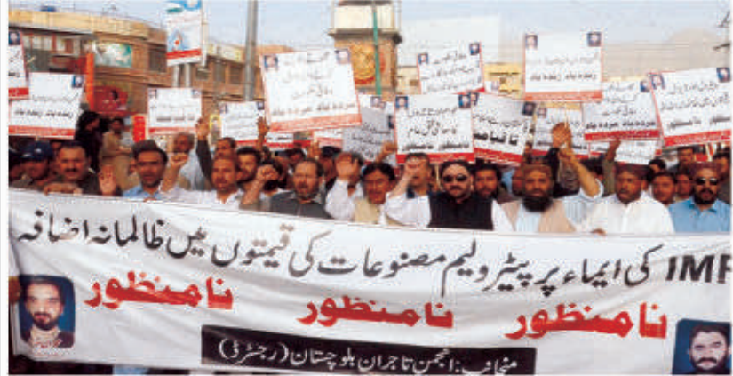
QUETTA: Activists of Anjuman Tajran Baluchistan shouting slogans during protest in favor of their demands at Bacha Khan Chowk in Provincial Capital.