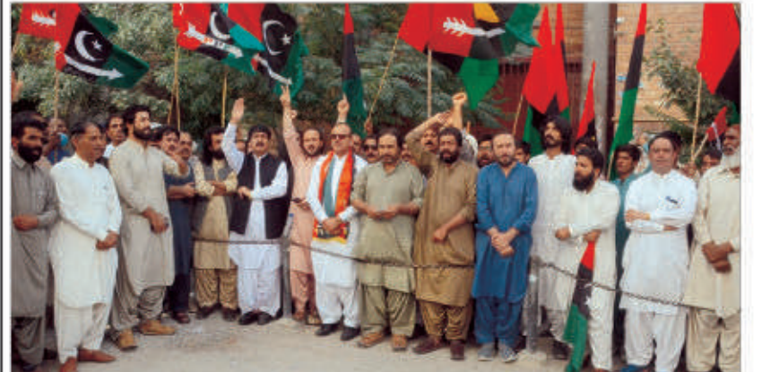
QUETTA: Workers of Pakistan Peoples Party hold a protest in favor of their demands outside press club in Provincial Capital.

ISLAMABAD: China Soong Ching Ling Foundation has launched the 2022 "Junior Cultural Ambassadors" Event to promote cultural exchanges and mutual learning, and tighten people-to-people bonds between different countries. The event is expected to build a platform for young people all over the world to make the acquaintance of each other both online and offline, and bring out more junior cultural ambassadors who would make their own share of contribution to people-to-people exchanges. The 2022 event, under the theme of "Get Connected Through Art: My Favorite Chinese Arts", encourages young people to exchange ideas and tell stories about Chinese culture through videos. With the support of the Bureau of International