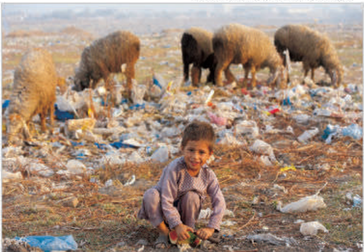
LAHORE: A gypsy girl searching food in garbage in the slum area of the Provincial Capital.

ISLAMABAD: Prime Minister Shehbaz Sharif has directed to provide two helicopters to extinguish the inferno in the forest area of Swat. At the request of the local administration, Shehbaz Sharif also directed that air support be provided immediately to control the fire in Babuzai area. It is pertinent to mention here that at least four people including three women were dead as fire erupted in Swat's mountainous forest, Chaksair on Saturday. Rescue teams along with the locals of Chaksair tried to control the fire and carried out relief operations. As per initial reports, four people including three women have been dead in the fire. The locals said initially fire broke out at four spots in Swat's mountainous forest, Brekot, Charbagh Kot, Kabal Segram and Chaksair. According to a local journalist of the area, the fire that erupted a week ago has been almost put under control. INP