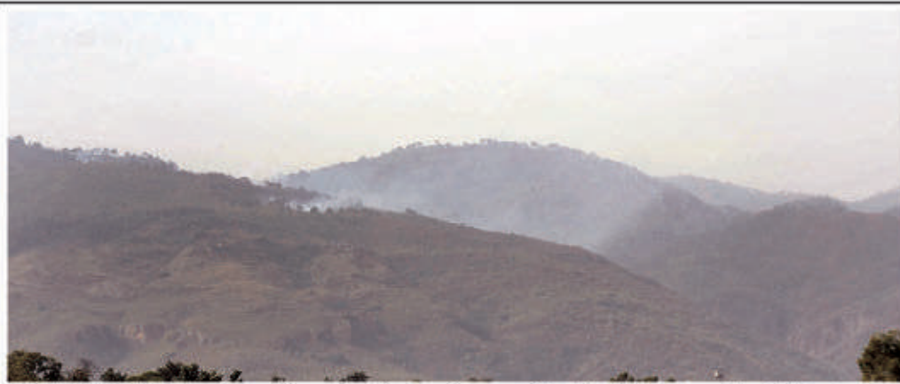
ISLAMABAD: A view of smoke rising from a fire in the Margalla Hills during hot weather in the Federal Capital.

SWEG has executed several mega projects in China. From Shaanxi, the company extended its business to different provinces of China, followed by its expansion from China to Pakistan, Kenya, Bangladesh and other countries. INP