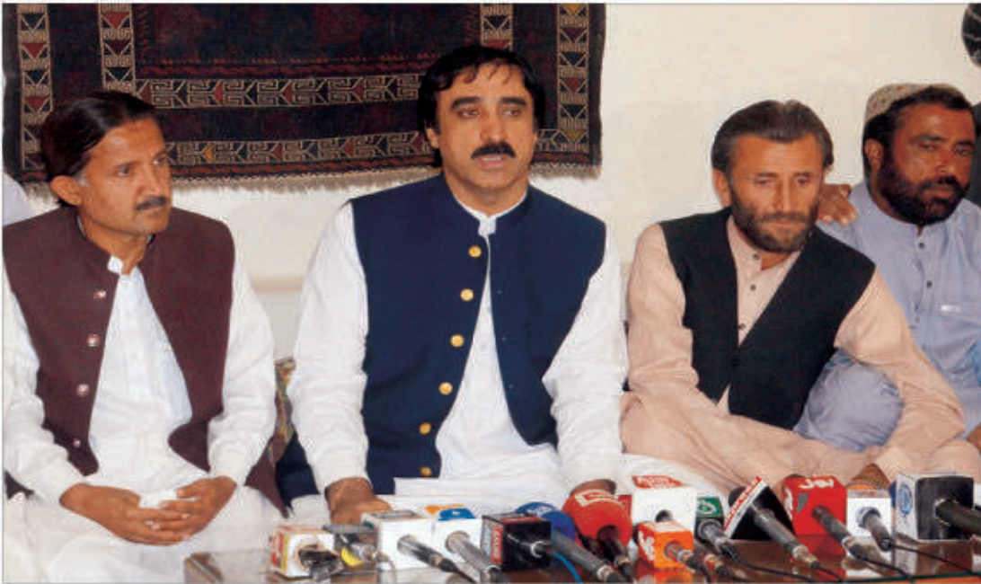
QUETTA: Provincial Minister of the Balochistan for Public Health Engineering Noor Muhammad Dumar addressing a press conference at press club in Provincial Capital.