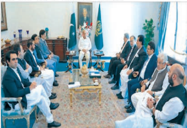
ISLAMABAD: Prime Minister Shehbaz Sharif chairs National Economic Council (NEC) meeting.

Tribesmen and personnel of the MERC faced difficulties in retrieving the dead bodies from the van. Traffic accidents have claimed scores of precious human lives in various parts of Balochistan. Road accidents have become the order of the day on Quetta-Karachi, Zhob, Chaman, Sibi, and Taftan highways. Reckless driving and narrow roads are considered as the underlying reason behind increasing incidents of traffic accidents. Balochistan being the areawise largest province of the country has no single-kilometer motorway despite repeated appeals to the federal government. CM Quddus Bizenjo expresses sorrow over the accident. Chief Minister Balochistan, Mir Quddus Bizenjo expressed grief and sorrow over the deadly traffic accident. In a statement issued after the traffic accident, he expressed sympathies with the broken families. Mr. Bizenjo directed the local administration to make sure provision of proper medical treatment to the injured and support the heirs of the victims.