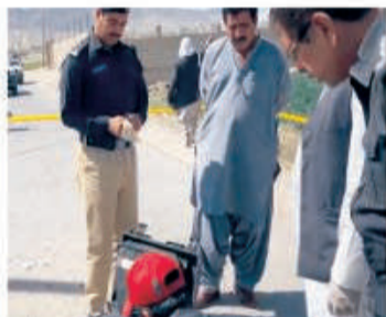
claim of responsibility for the attack. In the past, militants have repeatedly attacked security personnel and pro-government politicians in Khuzdar.