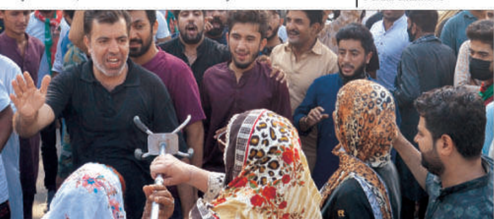
LAHORE: A view of clash between political parties sputters outside a polling station during By-Election of PP-158 in Provincial Capital.