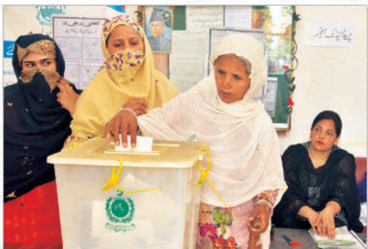
FAISALABAD: A woman casting her vote in a female polling station during By-Election of PP-97 in the city.

250 patients were admitted to the DHQ Kohlu