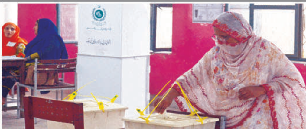
LAHORE: A woman casting her vote in a polling station during By-Election of PP-158 in Provincial Capital.