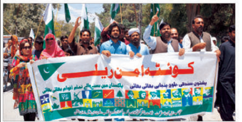
QUETTA: Members of different associations hold a peace rally in favor of their demands in Provincial Capital.

KARACHI: The Met Office has said that the Depression in the Arabian Sea has been at a distance of 270 kilometres from Karachi and slowly moved northwestward. The Depression (Intense Low-Pressure Area) over Northeast Arabian Sea and adjoining Gulf of Kutch has moved with a speed of 5 km per hour during last 18 hours and now lies centred around Latitude 22.8°N & Longitude 68.5°E, at a distance of about 270km southeast of Karachi and 220km from Thatta. Maximum sustained surface wind is 50-55 km/hour around the system centre. The system is likely to keep moving northwestward for some time and then recurve to westwards (towards Oman coast), weather department said in a statement. Under the influence of this weather system, rain-thunderstorms with a few heavy falls are likely in Karachi, Hyderabad, Thatta, Badin, Mirpurkhas, Thaparuker, Umerkot, Sanghar, Tando Muhammad Khan (TMK), Tando Allahyar, Dadu and Jamshoro districts of Sindh and Lasbella, Uthal, Ormara, Pasni, Gwadar, Jiwanj, Turbat, Awaran and Ketch districts of Balochistan during today and tomorrow. The Met Office has said that the sea conditions would remain very rough during next 2 to 3 days advising fishermen of Sindh and Balochistan not to venture into open sea till tomorrow. The windstorm may cause damage to loose and vulnerable structures, the weather office warned. INP