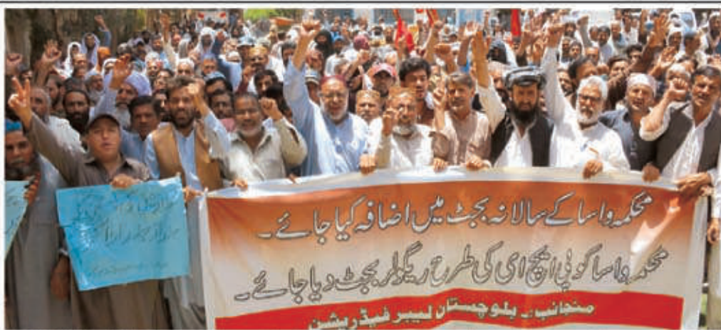
QUETTA: WASA employees hold protest in favor of their demands.

Also, the prime minister said, despite commitment, the revolving account was not opened with China INP.