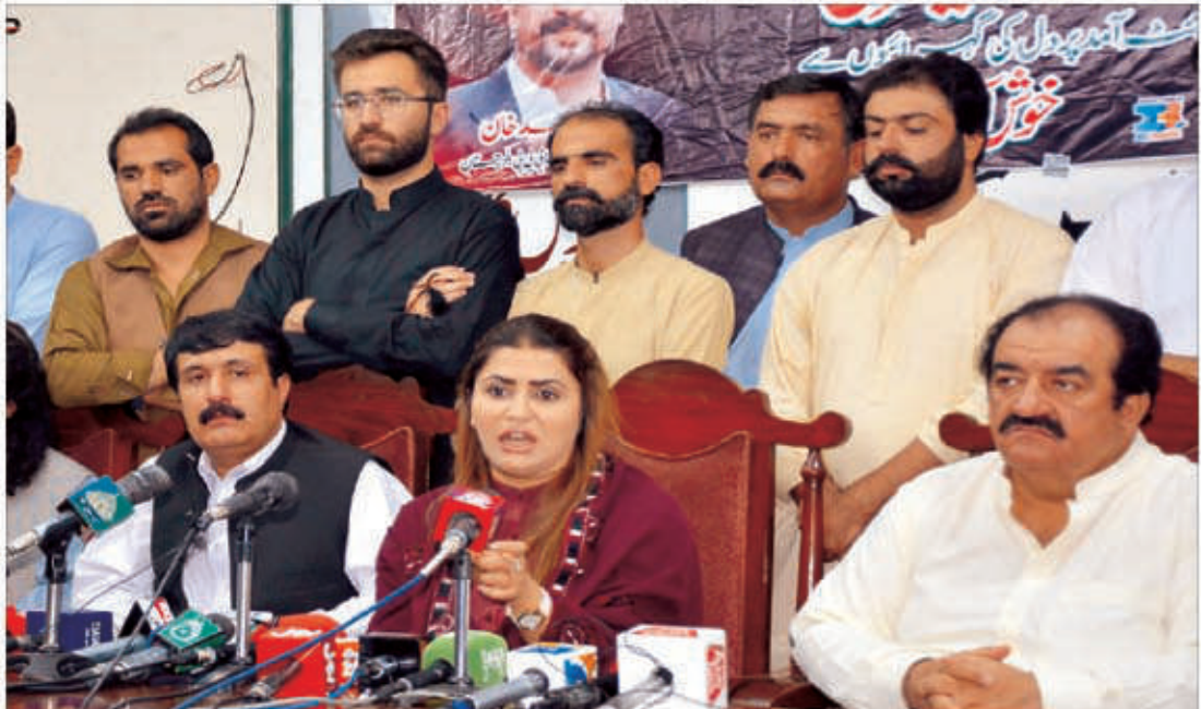
QUETTA: Shazia Marri Federal Minister for Benazir Income Support Programme addressing a press conference.