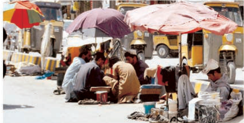
QUETTA: Daily wages labors sitting with their work tools along side Bacha Khan chowk while waiting for customers.

Practitioners in the fields of psychology and medicine shared that there were elaborate mechanisms, guidelines, and practices to help ascertain the true gender of an individual and help a gender-variant person better integrate in the mainstream. The idea of separating sex from gender is already