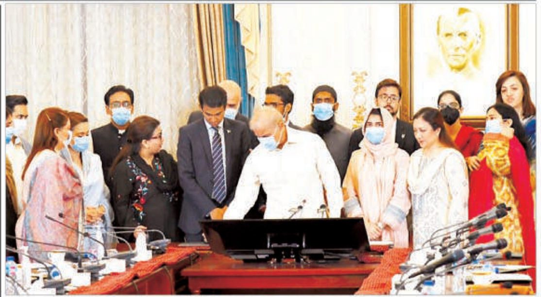
ISLAMABAD: Prime Minister Shehbaz Sharif inaugurating Innovation Hub.