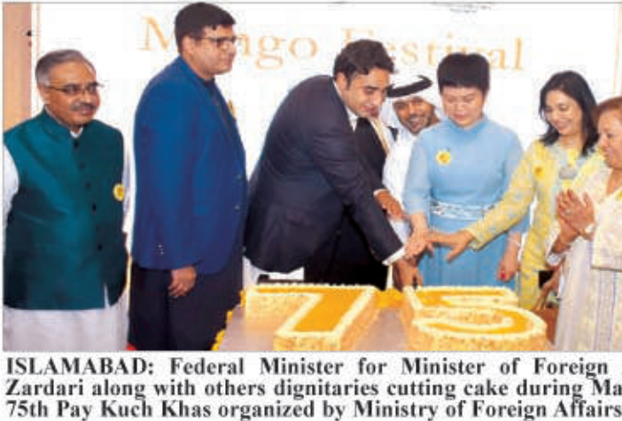
ISLAMABAD: Federal Minister for Minister of Foreign Affairs Bilawal Bhutto Zardari along with others dignitaries cutting cake during Mango Festival celebrating 75th Pay Kuch Khas organized by Ministry of Foreign Affairs.

ISLAMABAD: A three-member bench of the Supreme Court of Pakistan will hear a petition filed by Pakistan Tehreek-i-Insaf (PTI) against the Lahore High Court (LHC) verdict for the recount of votes for the election of Chief Minister Punjab. The three-member bench will be headed by Chief Justice Umar Ata Bandial along with Justice Ijaz ul Ahsan and Justice Jamal Mandokhail. The bench will begin hearing at 1:30 pm. Earlier in the day, Pakistan Tehreek-e-Insaf (PTI) filed an appeal against the Lahore High Court's (LHC) decision to recount votes in the CM election in the Punjab Assembly. According to details, PTI has filed an appeal against the LHC decision about the CM Punjab