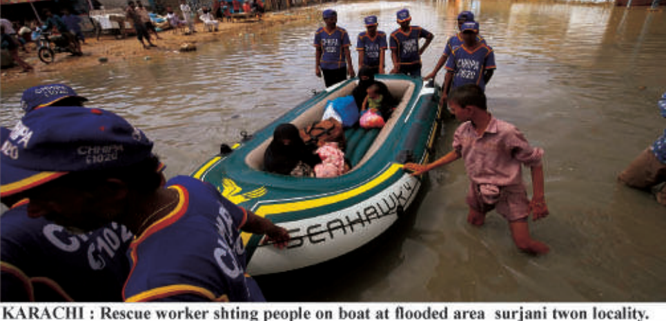
KARACHI: Rescue worker shting people on boat at flooded area surjani twin locality.