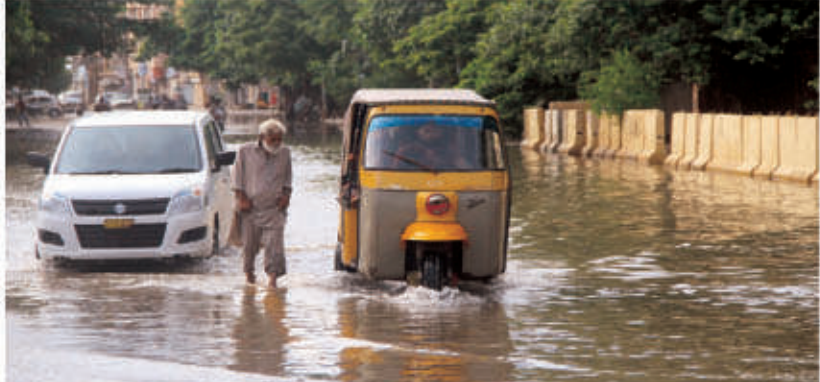
KARACHI: Motorists facing difficulties due to accumulated rain water at Court Road after the heavy rain in Provincial Capital.

more lives. In Lahore, a person was killed and three others were wounded from debris when a mud roof in Darogahwala caved in, according to Rescue 1122 officials. The survivors were pulled out from the rubble sent to the hospital for medical treatment. A further five people were wounded in Lodhran, located on the northern side of Sutlej River, when the roof of a house collapsed on top of them.