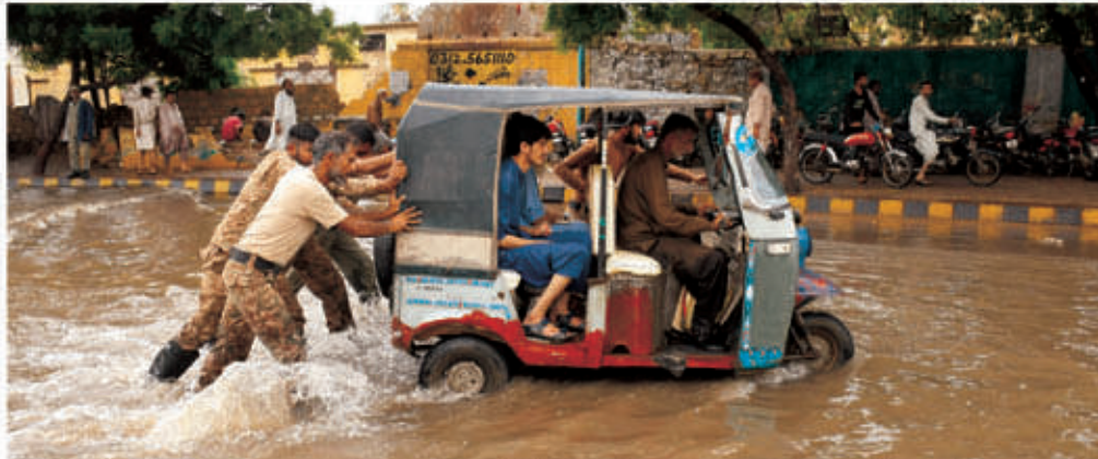
KARACHI: Army troops busy in relief and rescue operations after a heavy rain-fall in Provincial Capital. Several people have died in rain-related incidents across Pakistan.

diseases, this will be the most ideal result. Chen put forward a specific plan for this. "Biopesticides are our best choice due to ordinary pesticides may cause soil hardening or pesticide residues. Even the most common biological materials such as well-proportioned ginger and pepper spray can have a very good sterilizing and insecticidal effect. In terms of pest control, we use breeding beneficial insects, such as ladybugs, to kill pests."