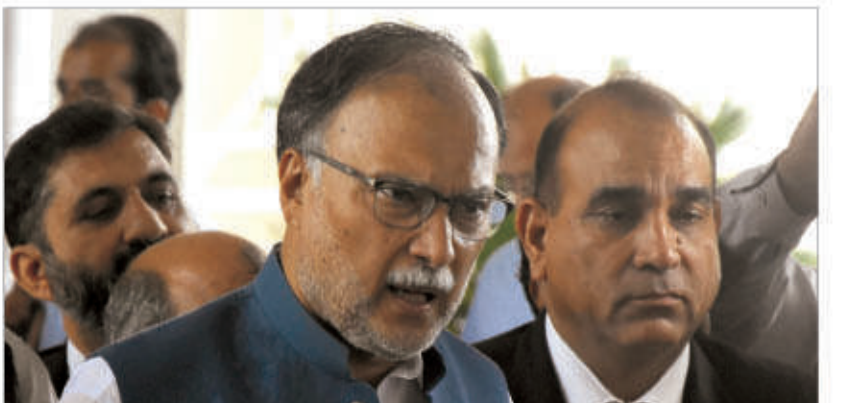
ISLAMABAD: Federal Minister for Planning, Development & Reform, Prof. Ahsan Iqbal talking with media persons outside Supreme Court.