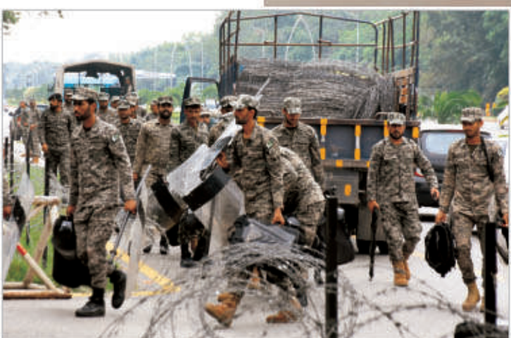
ISLAMABAD: Rangers personals arriving at Supreme Court during Supreme Court reserves verdict on formation of full court for hearing Punjab CM election case, at Supreme Court.