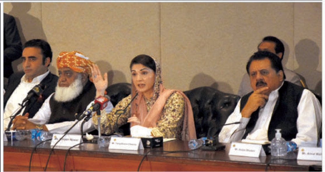
ISLAMABAD: Vice President of PML-N Maryam Nawaz Sharif addressing a press conference along with, President Pakistan Democratic Movement (PDM) Maulana Fazal-ur-Rehman, Chairman Pakistan People's Party Bilawal Bhutto Zardari, at Prime Minister Secretariat in Federal Capital.

its allies' counsels. Justice Bandial made the remarks during the hearing of a petition filed by PML-Q leader Chaudhry Parvez Elahi challenging Punjab Assembly Deputy Speaker Dost Mohammad Mazari's decision in the chief minister's re-election last week, which led to Hamza Shehbaz's victory. A three-judge bench will decide the fate of the ruling of the deputy speaker PA tomorrow (Tuesday).