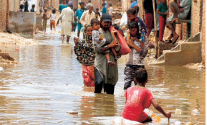
HYDERABAD: A view of disturbed families migrating from the Fatima Jinnah colony of Mehar Ali Society Latifabad.