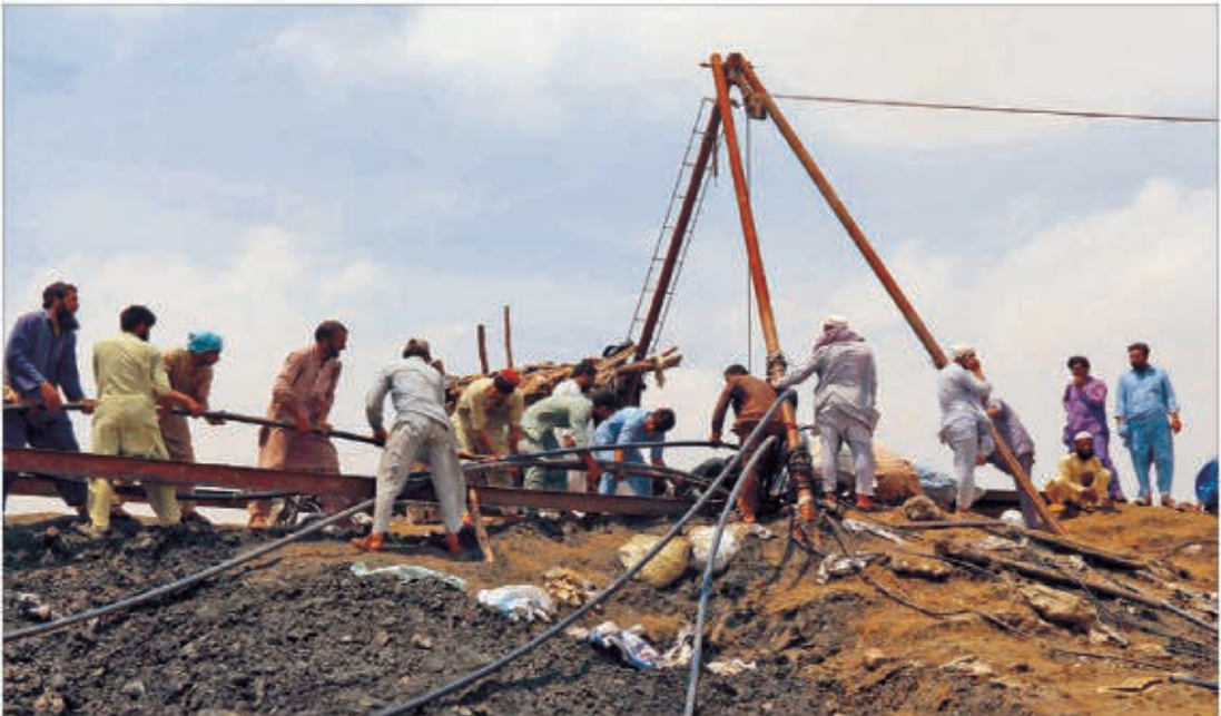
THATTA: Rescue work for recovery of 9 Coal Miners at Meeting Railway Station and Coal Mines area district Thatta, some 50 km from Hyderabad.