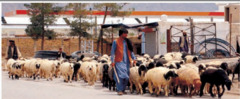
QUETTA: A livestock vendor is selling sacrificial animals on a road ahead of the upcoming Muslim festival of Eid al-Adha in Provincial Capital.

an increase in power tariff by Rs11.34 per unit. The demand came during the National Electric Power Regulatory Authority hearing for fuel adjustment charges for May. It is pertinent to mention here that the National Electric Power Regulatory Authority (NEPRA) has already fixed the power tariff at Rs24.82 per unit for the fiscal year of 2022-23 after a massive hike of Rs7.91 per unit. INP