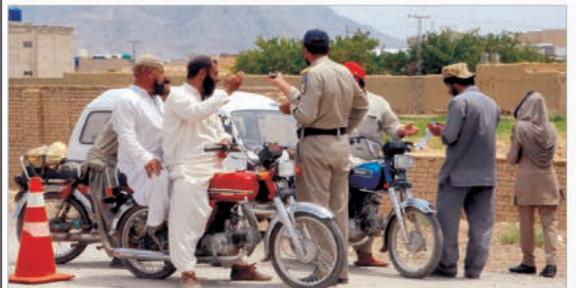
QUETTA: A traffic warden issued challan tickets to motorcyclists for not wearing safety helmets at National Highway in Provincial Capital.

Rights. "Such actions also come under international focus and tarnish the image of our country," he remarked. The president noted with concern that Pakistan stood at 157th position in the Freedom of Press Index-2022, which was very low and said the Reporters Without Borders (RSF), Human Rights Watch (HRW), Amnesty International (AI), and the International Commission of Jurists (ICJ) in their reports had attributed harassment, intimidation, and physical violence against journalists as the main reasons for the dismal position of Pakistan in the said index. INP.