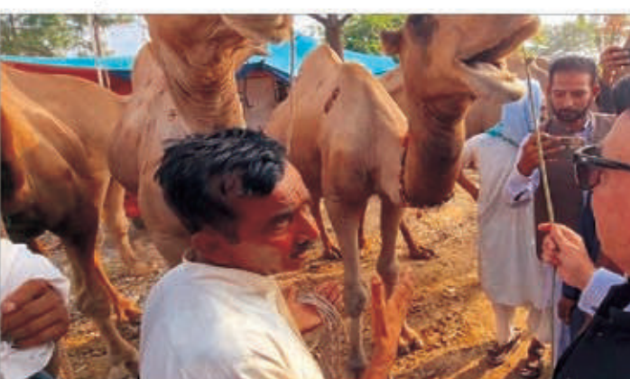
RAWALPINDI: Former Interior Minister Sheikh Rasheed Ahmad visiting sacrificial animal mandi and buying camel for Eid ul Adha.