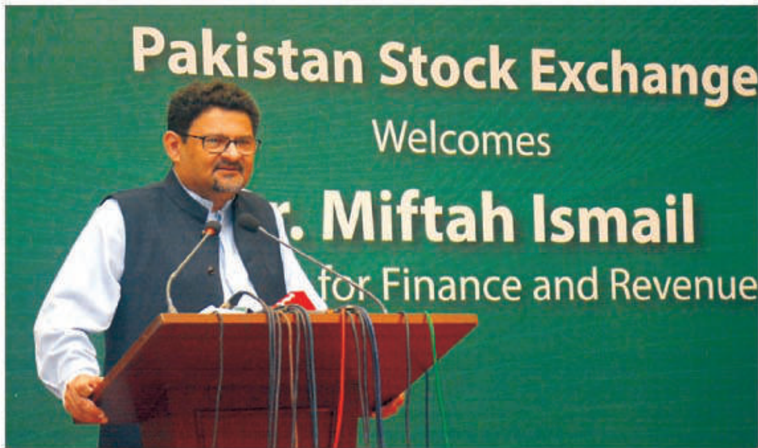
KARACHI: Federal Minister for Finance and Revenue Miftah Ismail addressing the members of Pakistan Stock Exchange (PSX).