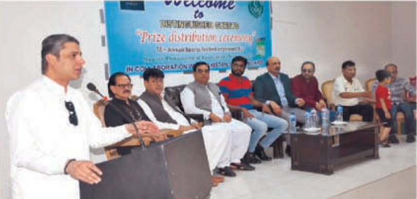
ISLAMABAD: Federal Minister for Inter-Provincial Coordination (IPC) Ehsan ur Rehman Mazari speaks at closing ceremony of RIPJA (P) Sports Festival organised by RWP ISB Photojournalists Association (RIPJA Professional) at Pakistan sports Board.

PESHAWAR: Khyber Pakhtunkhwa (KP) Health Department has decided to privatize 58 government hospitals across the province under the Public Private Health Initiative (PPHI). According to details, the Department of Health KP has issued an advertisement for privatising the 58 hospitals. Five hospitals from Peshwar, while all hospitals in categories C and D would be privatized under the PPHI project. The hospitals would be handed over to private companies through the health foundation. 24 hospitals from three tribal districts of KP will be privatized too. According to details, the Department of Health KP has issued an advertisement for privatising the 58 hospitals. Five hospitals from Peshwar, while all hospitals in categories C and D would be privatized under the PPHI project. INP