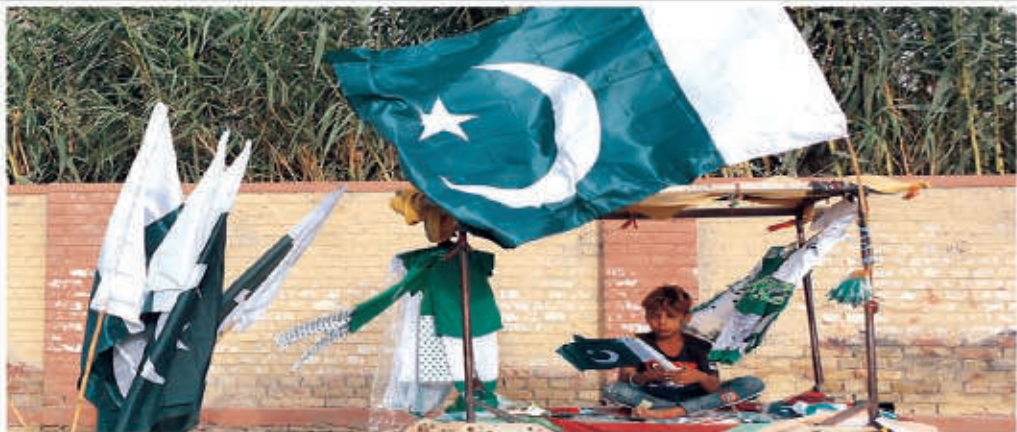
QUETTA: A child vendor selling National flag and related stuff along roadside on ahead of start 14 August independence Day celebration .

determination. It calls for the respect of their fundamental freedoms and basic human rights and for the reversal of all illegal and unilateral measures taken on or after 5 August 2019. It further said that the General Secretariat reiterates its call on the international community to take concrete steps for the resolution of the Jammu and Kashmir dispute in accordance with the relevant UN Security Council resolutions, INP