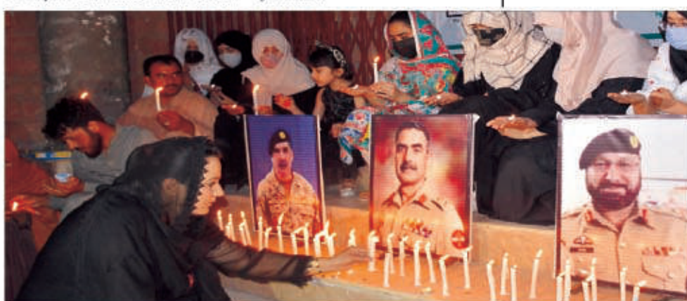
QUETTA: Woman activists of BAP lighting candles in memory of Pakl Army Helicopter crash victims.

Saeed Ghani said, "I assure my Kashmiri brethren that the whole of Pakistani nation is with them in their struggle for freedom and I salute the spirit and struggle of Kashmiris." INP