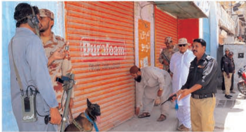
QUETTA: Security personal seal the shop on the route of 7th Muharram ul Haram procession.

Qatar on a "take-or-pay" basis to procure 3.75 million tonnes of LNG per year at 13.75% of crude price. In 2021, Pakistan struck another long-term contract with Qatar for three million tonnes per year of LNG at a 10.5% of crude. In total, Pakistan can import around 1,000 million cubic feet per day (mmcf), 900 mmcf and 100 mmcf, respectively, under long-term contracts with Qatar. Besides, Pakistan also makes spot purchases, which is less than 15% of total LNG imports. Pakistan is fast becoming an energy-deficient country as contribution of indigenous INP