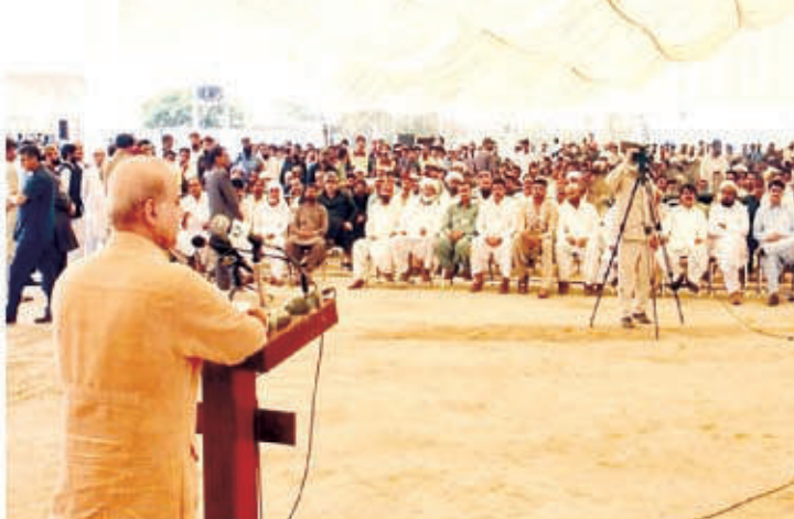
DERA GHAZI KHAN: Prime Minister Shehbaz Sharif addressing the flood affectees in Dera Ghazi Khan.