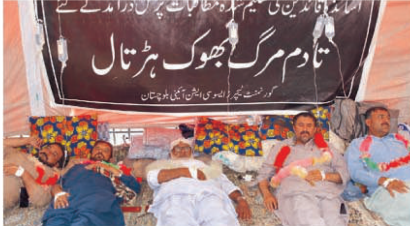
QUETTA: Government teachers association hold sit-in outside QPC.