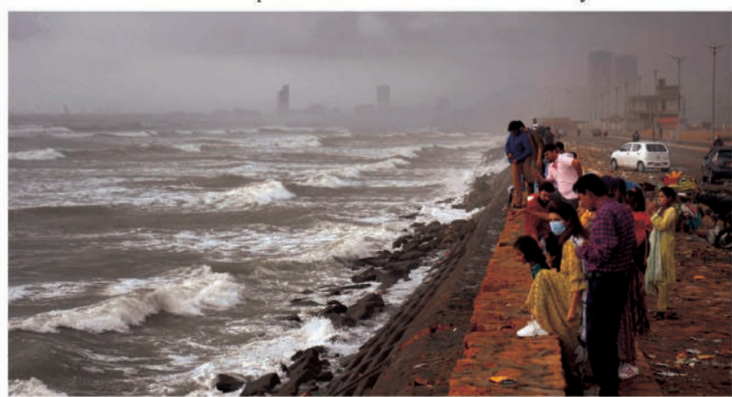
KARACHI: People are enjoying pleasant weather at Sea View picnic point in Provincial Capital.

Officers and staff will also be appointed at the Gawadar office of the Pakistan Railways. INP