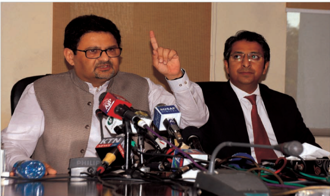
ISLAMABAD: Federal Minister for Finance and Revenue Miftah Ismail addressing a press conference in Federal Capital.

Rainfall may trigger landslides in Kashmir, hilly areas of Khyber Pakhtunkhwa, Galiyat, Murree, Chillas, Diamir, Gilgit, Hunza, Astore and Skardu during the forecast period.