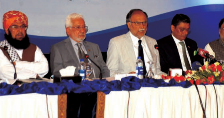
ISLAMABAD: Federal Minister for Planning, Development & Reform, Prof. Ahsan Iqbal addressing during a seminar on "All Parties Conference on Revival of Economy" at a local hotel in Federal Capital.