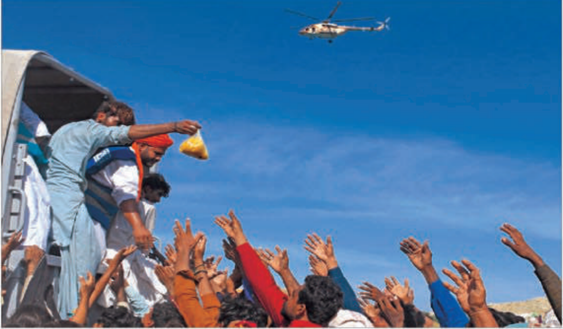
SEHWAN: A view of large number of flood affected People receive food aid from relief truck in Sehwan.

The community stated that they got motivation from social media to help the people in desperate need of food and shelter in Balochistan. Each package contained Wheat, Sugar, pulses, cooking oil, etc. Shah Jahan, Naseem Khan, Wali Muhammad, and Shariq were also among the distribution members of the community. The members of the Evo community aimed to further increase their relief activities in Balochistan and Peshawar.