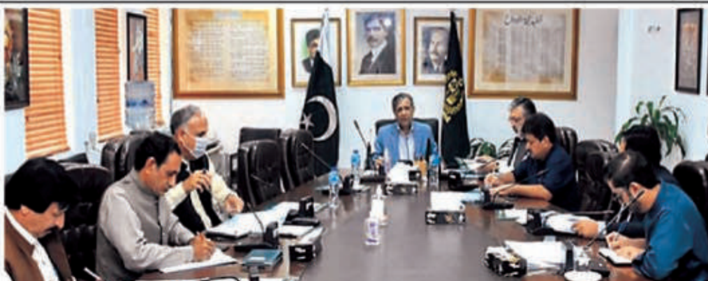
ISLAMABAD: Federal Minister for Law and Justice, Senator Azam Nazeer Tarar chaired a fifth meeting of Cabinet sub Committee to deliberate a policy relating to enforced disappearances at Ministry of Law in.

severely damaged the basic health system. The WHO regional director said that the flood victims will continue to be fully supported.