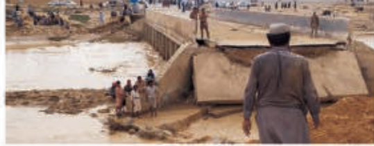
Balochistan totally paralyzed due to floods: The flood waves destroyed the infrastructure in Balochistan. The primary source of income for Balochistan's 85 percent population is agricultural. Floods destroyed crops on

down of physical communication between the provinces. The provinces faced food shortages, as all of the roads were broken and the bridges collapsed. Train service was also suspended due to the collapse of a bridge in Bolan, a dis-