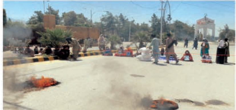
QUETTA: Families of missing persons burns tyres to protest in favor of their demands at Provincial Assembly Chowk, in Provincial Capital.