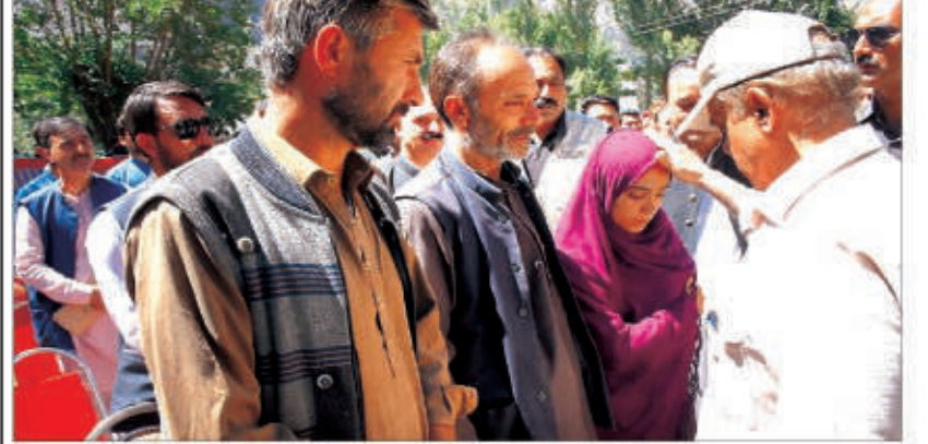
GAHKUCH: Prime Minister Muhammad Shehbaz Sharif meets the flood affectees of District Ghizer.

KARACHI: Sindh Information Minister Sharjeel Inam Memon, on Friday, informed that 670,602 people from torrential rains and flood hit areas were shifted to 1975 relief camps set up by government. The minister while informing about details of the losses caused by the flood and rains in the province and rescue measures carried out in affected areas said that victims accommodated in relief camps were being provided with food, water, medicine and other relief items. Over 9.716 million people in Sindh were directly affected by the torrential downpour and flash flooding, he informed and maintained that Sindh government was striving for relief and rehabilitation of the flood victims and rescuing the flood victims was its top priority. He informed that death tally due to disaster has reached at 522 while 21,885 people have been injured. Moreover, 101,901 cattle have also perished throughout the province during the unprecedented rains and flash flooding, he added. As many as 235 talukas and 1051 union councils have been affected by the rains, Memon said adding that 1.45 million houses have been damaged, completely or partially, while crops cultivated over 3.173 million acres have been destroyed. INP