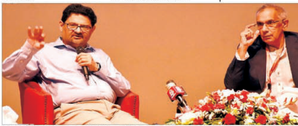
KARACHI: Miftah Ismail, Federal Minister for Finance and Revenue addressing in the discussion Session on 'The Current State of Pakistan's Economy' Economics and Social Sciences (SESS) at IBA.

ISLAMABAD: The federal government on Thursday asked the Supreme Court (SC) to dismiss a petition filed by former prime minister and Pakistan Tehreek-e-Insaf (PTI) Chairman Imran Khan against the recent amendments to the National Accountability Bureau (NAB) laws. According to details, the federal government has submitted a reply on Imran Khan's petition challenging the amendments to the National Accountability Bureau (NAB) ordinance. Raising objections over Imran Khan's petition, the federal government argued that the former premier was not the affected party not the application based on good faith. "The Supreme Court had declared it will not interfere in political matters", the written reply stated. INP