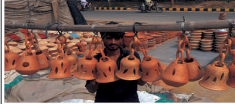
LAHORE: A vendor is displaying clay bells for customer attraction alongside a road at Johar Town, in Provincial Capital.

KARACHI: Extraordinary 1100mm rainfall lashed Sindh in this monsoon, Chief Minister Murad Ali Shah has stated while pointing to the gravity of the calamitous weather that wreaked havoc in the province. "According to estimates around 30 million-acre-feet water entered in the province," he said. "Now the seventh spell of monsoon has started." "Indus River while passing through Sindh divides the province in two parts and there is water on both sides of the river," CM Shah said. "Presently seven to eight million-acre-feet water standing in Kashmir, Shikarpur, Jacobabad, Kambar-Shahdadkot, Larkana and Jamshoro," he said. "We will drain out this water to the river, which will pass through the Manchar Lake," he said. "This all water will pass through the Left Bank Outfall Drain (LBOD) to discharge in the sea," Shah said. Sindh's chief minister said that Punjab has received 52 percent more rainfall in this season, while Sindh has got 800 percent more rainfall than average. "This or that Wadera is taking decisions, it is misgiving," he said. "All decisions being made by the irrigation department, 'if someone wants to talk with me over it, he is welcome, I will answer it,'" Murad Ali Shah said. INP