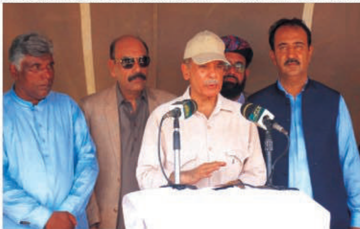
SUHBATPUR: Prime Minister Shehbaz Sharif talking to media after visiting flood relief camp district Sohbatpur.

concern over different diseases being spread in the flood-affected areas asking the administration to take measures to control them. During his visit to the flood-hit Sohbatpur district, he was briefed over the ongoing relief efforts to address the challenge of damages in the aftermath of calamitous floods. He instructed the authorities to not halt their relief work, no matter how much funds they needed for the rehabilitation of the flood affectees. INP