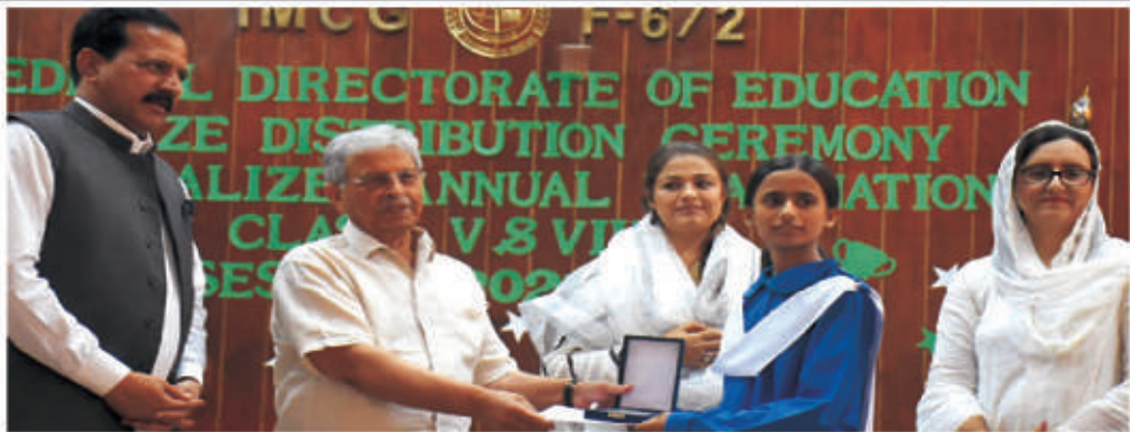
ISLAMABAD: Federal Minister for Education Rana Tanveer awarding to position holder student in a ceremony of class 5 & 8 centralized exams held at IMCG f6-2 on Wednesday. Parliamentary Secretary Zeb Jafar DG FDE Dr Ikram Principal Aliya Durrani also present.

957 acres of tobacco, 938 acres of vegetables, 837 acres of pulses, 2596 acres of date farms, 60 acres of sugarcane, and 85 acres of potato crops. While in Balochistan 108,229 acres of crops were affected while 24,854 cattle and over 81,000 chickens were reported dead causing damage of Rs19.84 billion. While in Punjab over 130,140 acres of crops were affected by devastating floods and rainfall and over 865 animals were reported dead amid the calamity, the Food Security Ministry reported. INP