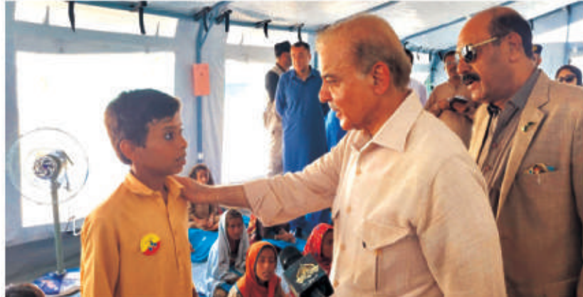
SUHBATPUR: Prime Minister Shehbaz Sharif visit a school setup at flood relief camp district Sohbatpur.

LAHORE: Eight members of Punjab Assembly belonging to PML-N have filed a joint application in a local court to transfer the case relating to ruckus in provincial assembly to another court. Through their application submitted on Wednesday in the Additional Sessions Judge Muhammad Jamil Bhatti's court, the PML-N MPs prayed that their bail pleas should be shifted to the court of another Additional Sessions Judge Yaseen Mohal. Through Moon Khokhar and Nasir Chohan Advocates they pleaded to the court that as per one FIR their bail pleas were being heard by one court, but the filing of another FIR in the same case they had applied for the bail in another court. They urged the judge to club their bail pleas in connection with both FIRs. Through Moon Khokhar and Nasir Chohan Advocates they pleaded to the court that as per one FIR their bail pleas were being heard by one court, but the filing of another FIR in the same case they had applied for the bail in another court. They urged the judge to club their bail pleas in connection with both FIRs. The interim sessions judge reserved his verdict on the joint application of the PML-N MPs including Rana Mashhood, Rukhsana Kausar, Saiful Malook. INP