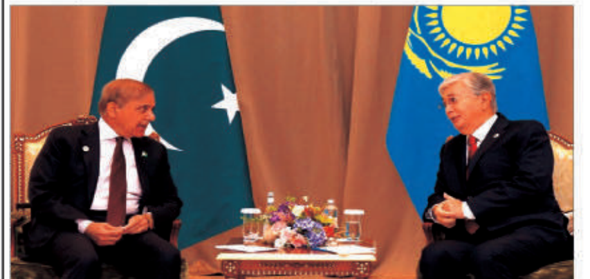
SAMARKAND: Prime Minister Muhammad Shehbaz Sharif meets President of Kazakhstan Kassym-Jomart Tokayev on the sidelines of SCO-CHS in Samarkand, Uzbekistan.

Sources told that a huge contingent of police have been deployed at Sadiqabad and Peshawar check posts to curb the commodity's movement.