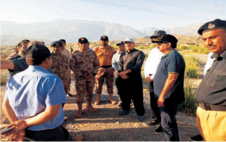
11-kilometers railway track flooded from Dera Allah Yar to Jacobabad

QUETTA: Federal Minister for Railways, Khawaja Saad Rafique on Friday said that the Pakistan Iran railway track would be repaired by September 30th. The Federal Minister arrived in this provincial capital and visited Bolan's Hirak area where a British-built ancient bridge collapsed as a result of the floods and torrential rains a few days back. Addressing a press conference, the Minister informed that the Pak-Iran railway track Taftan was damaged in 104 locations because of floods and heavy rainfall. He however expressed the hope that the track would be restored by the technical staff of the Pakistan Railways by the 30th of September. Other high-level railway officials also accompanied the minister during his visit to Balochistan and visited the affected sites. "Pakistan railway suffered huge financial losses in Balochistan due to floods," Khawaja Saad Rafique mentioned. He said the restoration of train service in the rugged Bolan mountains would take some time as floods swept away tracks and bridges and the technical teams were spending days and