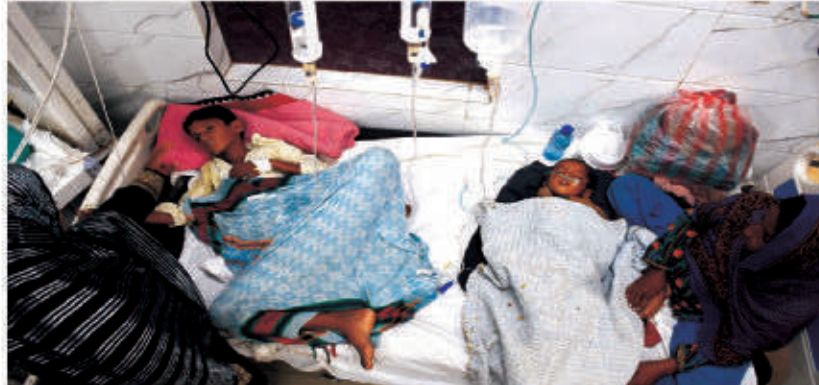
HYDERABAD: Flood affected woman taking care of her child, who is under treatment from Malaria and Gastro at Sehwan Hospital.

"We warn the government alliance that we will never allow such tactics to succeed," he declared. "Due to their incompetence, the country has already been stuck in the quagmire of anarchy and economic misery," he censured. INP