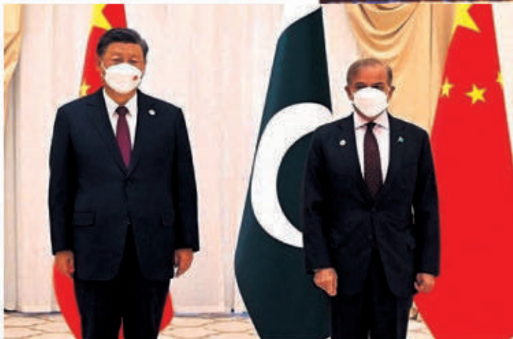
SAMARQAND: Prime Minister Muhammad Shehbaz Sharif meets President of China, Xi Jinping on the sidelines of SCO-CHS Summit in Samarqand, Uzbekistan.

said. "Our carbon emission is less than one per cent. Yet nature had this in store for us." PM Shehbaz said that it would be a "big mistake to ignore Afghanistan this time around", highlighting that peace in Pakistan and Afghanistan was interlinked. Shehbaz had arrived in the historic city of Samarkand on a two-day visit on Thursday. Foreign Minister Bilawal Bhutto, Finance Minister Miftah Ismail, Defence Minister Khawaja Asif are among the officials part of the Pakistani delegation. On the second day of his visit, the prime minister attended the close-format CHS meeting at the Congress Centre where participants were welcomed by Uzbekistan President Shavkat Mirziyoyev. Web Desk