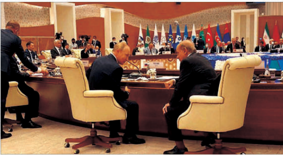
SAMARKAND: Prime Minister Muhammad Shehbaz Sharif interacts with Russian President Vladimir Putin during Shanghai Cooperation Organization Council of Heads of states in Samarkand, Uzbekistan.

PM Shehbaz, along with leaders of the eight-member SCO, attended the close-format CHS at the Congress Centre, where he was welcomed by President of Uzbekistan Shavkat Mirziyoyev, Russian President Vladimir Putin, Chinese President Xi Jinping, Uzbek President Mirziyoyev, Iranian President Ebrahim Raisi, Azerbaijan President Ilham Aliyev, Tajikistan President Emomali Rahmon, Belarus President Alexander Lukashenko, and