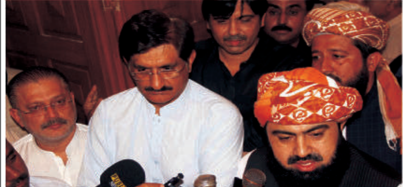
HYDERABAD: Federal Minister for Telecommunication Moulana Asad Mehmood talking to media persons along with Chief Minister of Sindh Syed Murad Ali Shah and Sindh Information Minister Sharjeel Inam Memon after a meeting at Shabbaz Hall, in the city.

The study for building a bypass in Kambar-Shahdadkot. INP