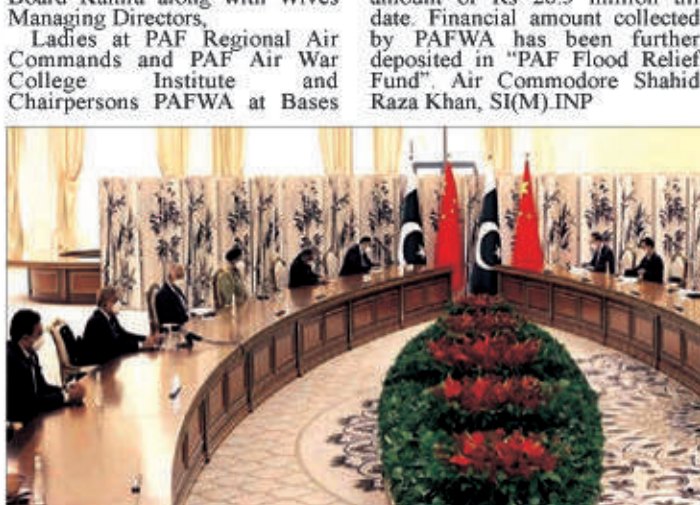
SAMARKAND: Prime Minister Muhammad Shehbaz Sharif held a bilateral meeting with President Xi Jinping on the sidelines of the 22nd SCO Council of Heads of State in Samarkand, Uzbekistan.