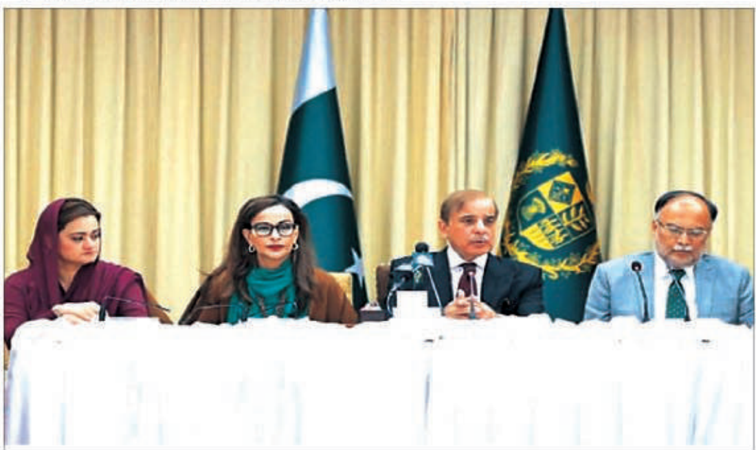
ISLAMABAD: Prime Minister Shehbaz Sharif addressing a press conference at Prime Minister house.

"Imran Khan is clearly guilty in Toshakhana disqualification case. If other political leaders continue to suffer punishment in similar cases, is Imran Khan above the law and institutions?" Sherry Rehman queried. The minister emphasised that law should be one for all.