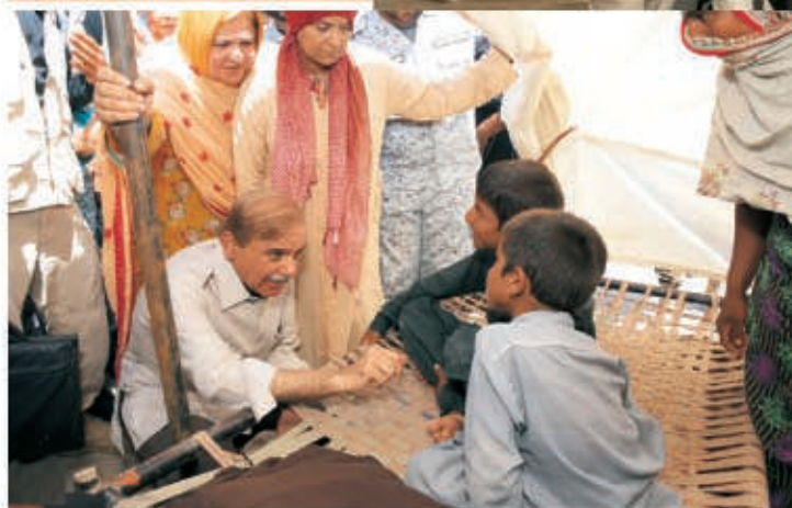
DADU: Prime Minister Shehbaz Sharif talk to flood effected of district dadu at tent city established at village Jakhro.

The dead bodies of the three brothers murdered in the firing incident were shifted to Chaman for burial. Panic prevailed in the border city with Afghanistan in the aftermath of the tragic incident.