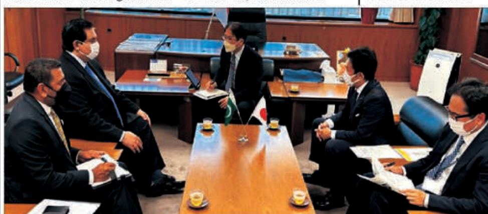
TOKYO: Federal Minister for energy Khurram Dastgir Khan met State Minister Nakatani at Japanese Ministry of Economy Trade & Industry.

The water inflow in river at Chashma has been measured 108,100 cusecs and outflow 87,400 cusecs. The water inflow in Indus at Taunsa Barrage has been 81,500 cusecs and outflow of water 61,100 cusecs. INP