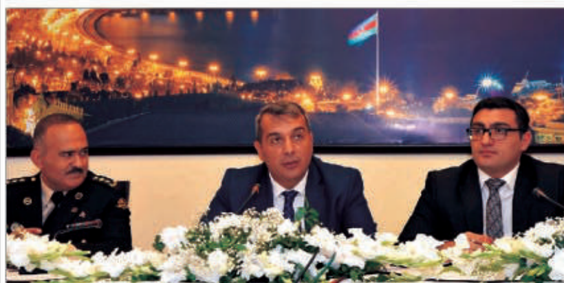
ISLAMABAD: Ambassador of Azerbaijan Khazar Farhadov speaks during a press conference at embassy of Azerbaijan.

needs of local population. Meanwhile, senior officials of Ministry of National Food Security and Research briefed the committee about the arrangements made for wheat sowing in flood hit areas in the country and other steps which were being taken to revive local agriculture sector after devastation of flash floods and torrential rains. It was further informed that government was preparing a special package of incentives for wheat growers of flood hit areas to restore and revive the agriculture in these areas, adding that the package would have special focus on enhancing area under wheat cultivation. Besides, it was also proposed to provide one bag per-acre DAP to farmers of the affected areas as an amount of Rs80 billion would be required to execute. INP