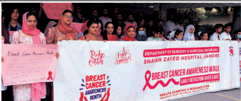
LAHORE: Doctors and nurses hold placards during Breast Cancer Awareness Walk at Shaikh Zayed Hospital on the eve of World Breast Cancer Day, in Provincial Capital.