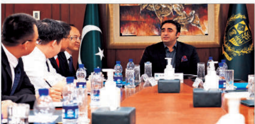
ISLAMABAD: Foreign Minister Bilawal Bhutto Zardari meeting with a Chinese senior expert group of consisting disaster management and flood control at Foreign Office in Federal Capital.