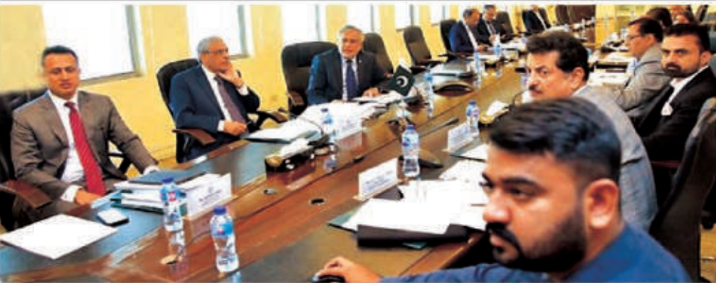
ISLAMABAD: Federal Minister for finance and Revenue Senator Ishaq Dar held a virtual meeting on first Joint Economic Sub Committee of the Saudi-Pakistan Supreme Coordination Council with HRH Prince Abdulaziz Bin Salman Bin Abdulaziz Ministry of kingdom of Saudi Arabia.