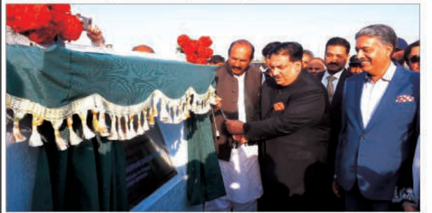
KAHUTA: Federal Minister for power Engr Khurram Dastagir Khan lays down the foundation stone of 500 Kv Maita switching station near Kahuta.

ISLAMABAD: Federal Minister for Defense Khawaja Muhammad Asif on Thursday said that at one time, Imran Khan was offering extension to the Army Chief but when he declined to take illegal and unconstitutional steps he (Imran) started to cast aspersions on his integrity. When Imran Khan was in power, he crossed all limits to praise the military leadership to remain in power but after no confidence motion, he started maligning the institution. Addressing a press conference, he said, for Imran Khan his personal character was important over Pakistan's sovereignty and country's institutions. "He uses one language in front of media against the institution while behind the closed doors, he uses apologetic language in secret meetings," said the defense minister. He said earlier the opposition was exposing his real face to the nation but now it has been disclosed directly from the institution. Imran had been offering deal of extension in service for the indefinite period to the Army Chief against no confidence motion and to protect his government, said the defense minister adding this information has come straight from the horse's mouth.