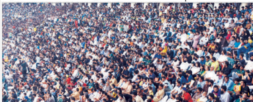
LAHORE: Large number of cricket fans gathered at Gaddafi Stadium in Provincial Capital, during Sixth Twenty20 International cricket match between Pakistan and England.

Speaking at the occasion, Ambassador Haque appreciated the urgent assistance offered by the People's Government of Ningxia, Hui Autonomous Region. Recalling that the two countries have always stood together in difficult times in the past, Haque said that Chinese assistance to Pakistan for flood victims has once again proven the unique nature of fraternal ties between the two countries. INP