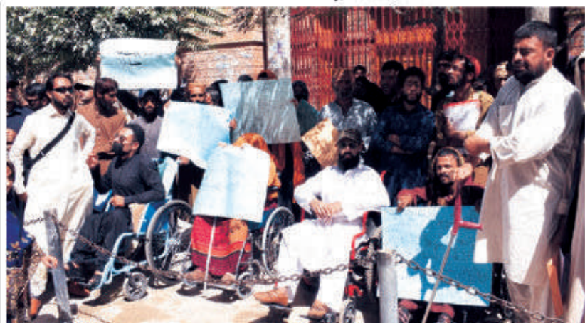
QUETTA: Special persons Balochistan ithtiad hold protest outside QPC.

PESHAWAR: Former prime minister and PTI chairman Imran Khan Friday announced that he would soon give a call to his supporters to pull country out of the crisis. Addressing a ceremony at Lahore's Edwards College in Peshawar, Imran Khan said he will not allow dacoits to loot resources of the country and will fight them even if he has to do it alone by himself. He asked the masses to come out for real independence and give a message to everyone that they will not be a slave to any superpower. Imran Khan said properties of the Sharif family were unearthed in Panama Leaks but the 'biggest dacoits' are being given NRO, he claimed. The former prime minister said societies cannot prosper without rule of law in the country. The law and justice system should be the same for rich and poor, he added. On the economic situation, Imran Khan said the rupee has devalued over 30pc against US dollar since the ouster of his government and said the masses are facing the worst inflation in the history of Pakistan. INP