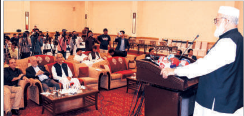
LAHORE: Leader of Jamaat-e-Islami Liaqat Baloch addressing to the Seminar organized by Pakistan Federal Union Of Journalists (PFUJ) at a Local Hotel, in Provincial Capital.

Earlier on September 13, flour mill owners blamed the provincial government for the ongoing flour crisis in the province, alleging that the food department failed to procure wheat according to the requirement for this year. Pakistan Flour Mills Association (PFMA) Balochistan chapter representatives said there was a huge gap between the demand and supply which created the crisis. They said flour mill owners were being blamed for the crisis, while in reality, the provincial government has imposed an inter-provincial and inter-district ban on the transportation of wheat during the harvesting season. INP