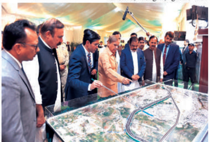
ISLAMABAD: Prime Minister Muhammad Shehbaz Sharif is being briefed on Bara Kahu Bypass Project.