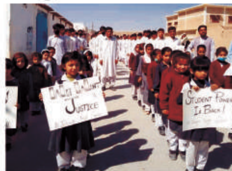
full-throated slogans against the administration

The students had carried placards and banners inscribed with slogans condemning the killing of Israr Khan in the area. They chanted