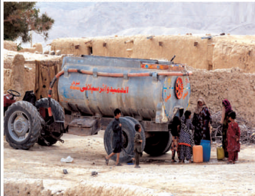
QUETTA: Children busy in filling their water pots from water tanker supply in city locality.

And if a virus has jumped hosts once, it is more likely to do so again. The analysis found pronounced differences between viruses and hosts in the lakebed, "which is directly correlated to the risk of spillover," said Aris-Brosou. INP