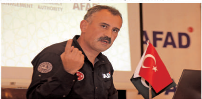
ISLAMABAD: Deputy President Disaster and Emergency Management Authority (AFAD) Omer Bozkrt addressing a press conference at Embassy of Turkey in Federal Capital.

logical achievements, free movement of people, and convenience of financial supply, providing solutions for promoting trade facilitation and raising the level of economic and trade cooperation among SCO countries. "These cases are aimed at the problems existing in the economic and trade cooperation between the SCO and BRI countries," Meng Qingsheng, Member of the Party Working Committee and Deputy Director of the Administrative Committee of SCODA, highlighted on the occasion that, "SCODA has cumulatively launched more than 50 cases of system innovation. A number of distinctive and influential achievements INP