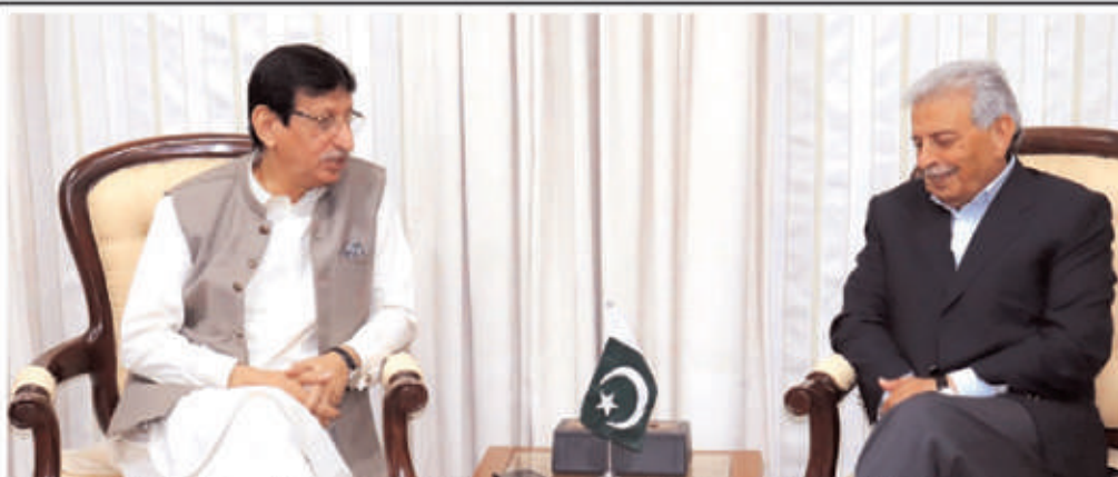
ISLAMABAD: Federal Minister of Information Technology and Telecommunication Syed Amin Ul Haque calls on Rana Tanveer Hussain, Federal Minister for Education and Professional Training.