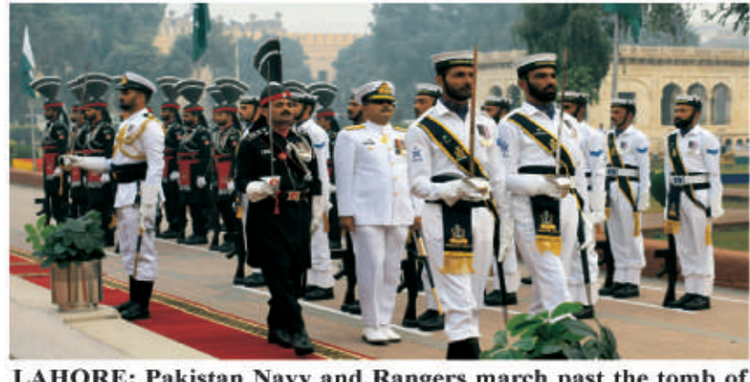
LAHORE: Pakistan Navy and Rangers march past the tomb of national poet Allama Mohammad Iqbal during 144th anniversary ceremony of the poet of the east, Dr Allama Iqbal in Provincial Capital.