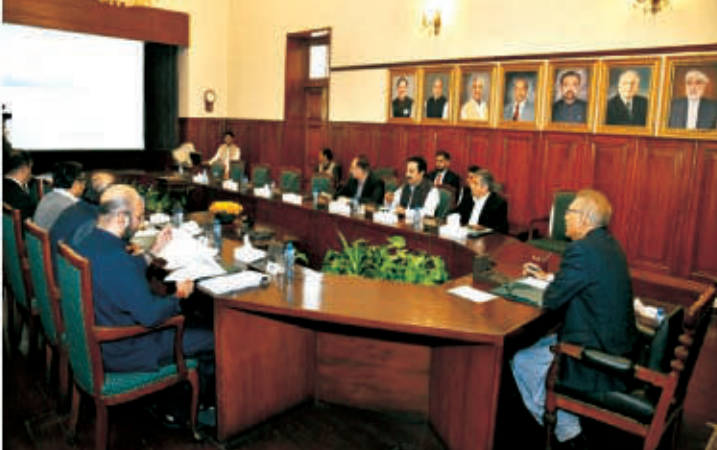
President Dr, Arif Alvi being briefed about development projects and the overall law and order situation in khyber (akhtunkhwa), at Governor House.

last three matches and they followed that today. I want to thank the crowd, it feels like we are playing at home," said Pakistan captain Babar Azam. Some critics are hoping, Babar can repeat the famous 1992 world cup history. Pakistan made an awful start to this tournament but now seems to have almost unstoppable momentum as they look to repeat their success in the 1992 50-over World Cup in Australia under the captaincy of Imran Khan. Men in green secure the finals seat but the question is who will be facing Pakistan in the finals of the ICC world t20, India or England? PAKISTAN will face either England or India in Sunday's final, which will be played in Adelaide on Thursday. But Pak fans want Pak - India clash in the final at Melbourne cricket ground on Sunday and to take group stage match revenge. Can Pakistan's second T20 title, Can Pakistani fans sing Dil Dil Pakistan at Melbourne cricket ground, it will be known on Sunday.