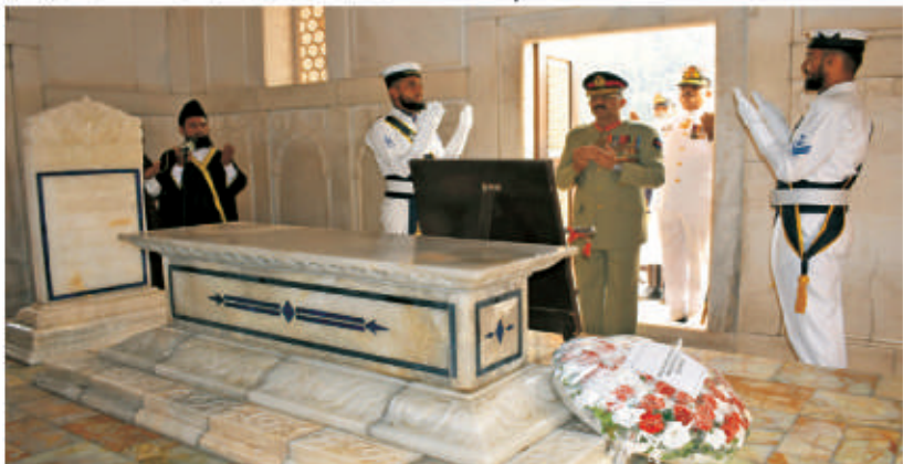
LAHORE-Nov09: Pak Army Officer offering Fatcha after laying floral wreath during Change Of Guard ceremony during 144th birth anniversary ceremony of the poet of the east, Dr Allama Iqbal.