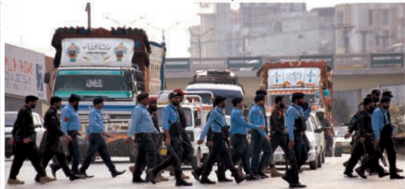
ISLAMABAD: Police personals crossing Faizabad Bridge as capital administration deployed police around Islamabad entrance due to PTI long march arriving in Federal Capital.