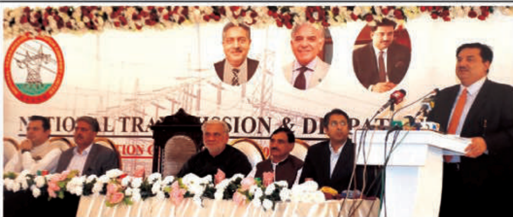
FAISALABAD: Federal Minister for Energy Engr Khurram Dastgir Khan addressing the inaugurating ceremony of 500 KV Grid Station.

"This country needs peace and unity. This population doesn't want to fight anymore." He signaled that Brazil was ready to take its place again on the international stage, after Bolsonaro aligned himself with former US president Donald Trump and took frequent aim at traditional allies.