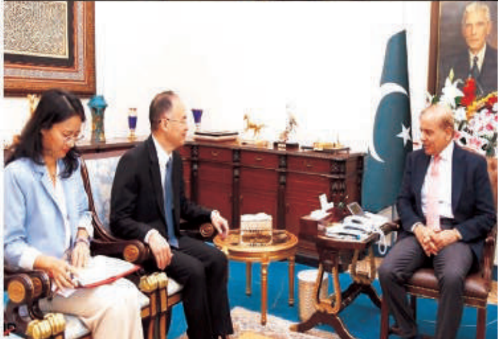
ISLAMABAD: Chinese Ambassador to Pakistan Nong Rong calls on Prime Minister Shehbaz Sharif.