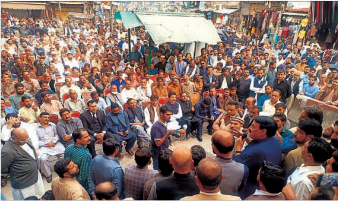
RAWALPINDI: Former Minister for Interior Sheikh Rasheed Ahmad addressing the long march preparation meeting at Lal Haveli.

The data of data the State Bank of Pakistan shows that the volume of exports to SAARC member countries reached $167.490 million in September 2022 as compared to $130.611 million in the same month of the previous fiscal. The exports of various goods from Pakistan to SAARC member countries including Afghanistan, Bangladesh, India, Maldives, Nepal, and Sri Lanka grew by 17% and reached $452.113 million in the first three months of the current fiscal as compared to $387.058 million in the corresponding period of the previous financial year. The volume of imports from SAARC member countries stood at $29.970 million in September 2022. Pakistan had a trade surplus of $137.580 million with SAARC member countries in September 2022. In addition, the trade surplus with SAARC member countries during the first three months of the current fiscal was recorded at $362.040 million. In September 2022, Pakistan had a trade surplus with Afghanistan, Bangladesh, Maldives, Nepal, and Sri Lanka while a trade deficit was recorded with India. Bangladesh remained the top importer of Pakistani goods in September, followed by Afghanistan and Sri Lanka.