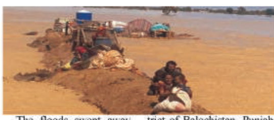
The floods swept away dams and destroyed the buildings, houses, roads, and bridges in Balochistan, KPK, and Sindh. The communication links were destroyed by the merciless waves of the flash floods. This resulted in the break-

Balochistan is the most vulnerable province of Pakistan to climate change. Many times this province has faced different types of natural disasters due to climate change. Drought is the major threat to Balochistan as Barkan the district of Balochistan faced a prolonged drought of 22 months from 1999 to 2002, and Quetta experienced severe droughts in 2000, 2004, and 2008. During this monsoon season, Balochistan faced extreme floods in almost every part of the province. Houses damaged in Quetta