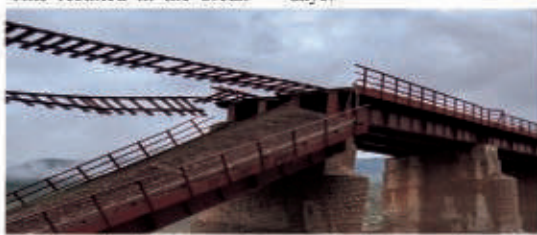
Balochistan totally paralyzed due to floods: The flood waves destroyed the infrastructure in Balochistan. The primary source of income for Balochistan's 85 percent population is agricultural. Floods destroyed crops on

down of physical communication between the provinces. The provinces faced food shortages, as all of the roads were broken and the bridges collapsed. Train service was also suspended due to the collapse of a bridge in Bolan, a dis-