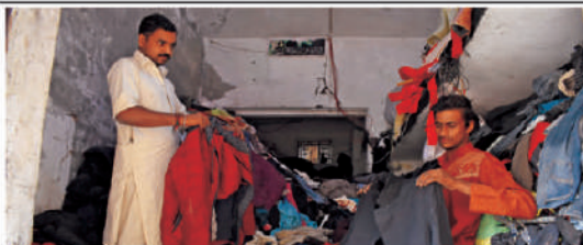
LAHORE: Vendors are busy in displaying secondhand warm clothes at their workplace in Container Market in Provincial Capital.