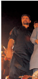
FAISALABAD: PTI leader Shah Mahmood Qureshi addressing to their Supporters during a protest in favor of their demands at Ghanta Ghar Chowk in the city.