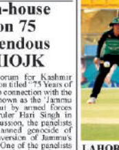
LAHORE: Ireland women cricket team player plays a shot during one day cricket match between Pakistan and Ireland Gaddafi Stadium in Provincial Capital.

ISLAMABAD: The Legal Forum for Kashmir (LFK) hosted an in-house discussion titled "75 Years of Horrendous Genocide in IIOJK" in connection with the November 1947 massacre, also known as the Jammu Genocide.