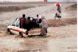
The Karakoram Range 39 glaciers are responsible for ice-dam formation. On the other hand, 36 glaciers build ice barriers in the running rivers due to frontal advance, near to the densely populated areas of the Karakoram region.

Meanwhile, rigorous exploration of the Anash lake of Hunza valley in Gilgit-Baltistan is the distinctive event to study the future threat of climate change in the lake of freshwater. The lake flooding displaced more than 6,000 people from upstream villages and inundated over 19 kilometers of the Karakoram Range 39 glaciers are responsible for ice-dam formation.