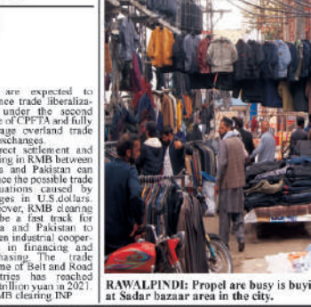
RAWALPINDI: Propel are busy in buying warm jackets in Landa Bazar at Sadar bazaar area in the city.

The Chairperson stated that on November 6, Jammu Muslims in huge numbers, including men, women and children were seemingly dispatched towards Pakistan in trucks but before they could reach their destination, they were attacked by Hindu extremists, Indian army and forces of Maharashtra.