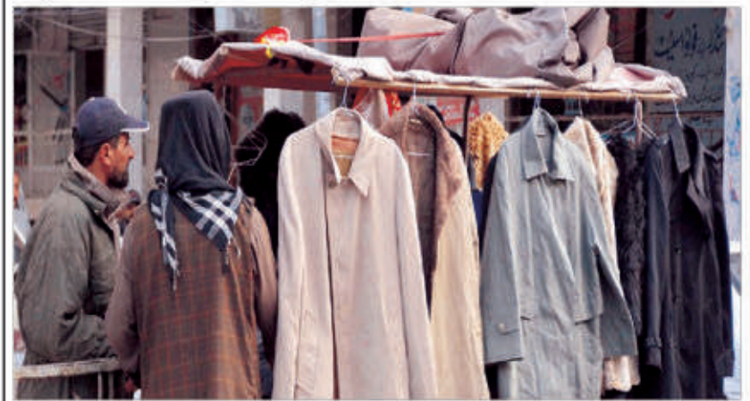
QUETTA: A man busy in purchasing warm coat from a roadside vendor.

added the finance minister. Dar added that the country has financial dealings with Saudi Arabia, China, and the United Arab Emirates (UAE). "During the prime minister's visit to Saudi Arabia, meetings were also held with the Saudi authorities. From these meetings, you will see that there will be further improvement for Pakistan," said Dar. Dar also said that Saudi Arabia will set up a refinery in Gwadar, adding that this is an investment of around $11 or $12 billion. He further said that this project was started in October 2015 that he was in Riyadh at that time and that he had meetings with high Saudi officials. "Due to the political crisis and change of government in Pakistan, this refinery could not be established, now it has been decided to establish the refinery again," the finance minister added. Online