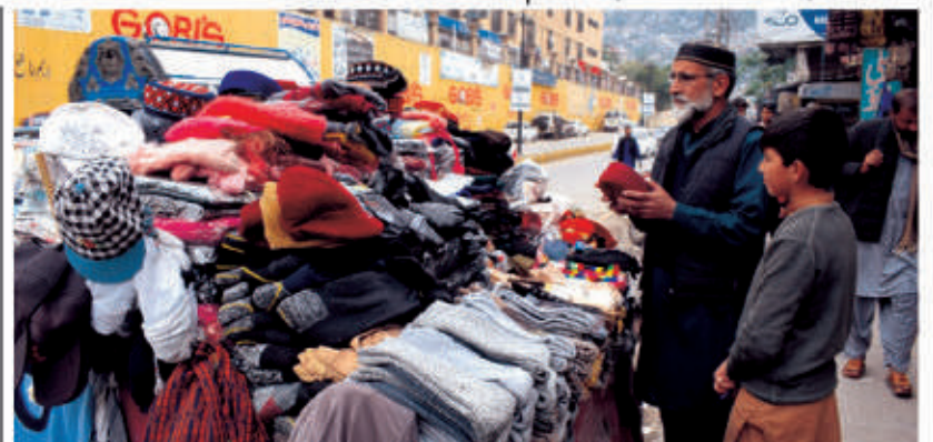
MUZAFFARABAD: A young vendor is selling warm caps on his push cart alongside a road during cool weather in the city.

KARACHI: With the advent of the winter season, the gas crisis seems to have worsened as the Sui Southern Gas Company Limited (SSGC) halted gas supply to industries across Karachi. In adherence to the Ministry of Energy (Petroleum Division) gas load management plan, that places domestic and commercial customers on top of the priority list, it has been decided to suspend gas supply to all general industries from November 15 to February 28, 2023," a statement issued by the gas company read. It said the decision is aimed to meet the rising demand of domestic customers in Sindh and Balochistan. "In adherence to the Ministry of Energy (Petroleum Division) gas load management plan, that places domestic and commercial customers on top of the priority list, it has been decided to suspend gas supply to all general industries from November 15 to February 28, 2023," a statement issued by the gas company read. It said the decision is aimed to meet the rising demand of domestic customers in Sindh and Balochistan. INP