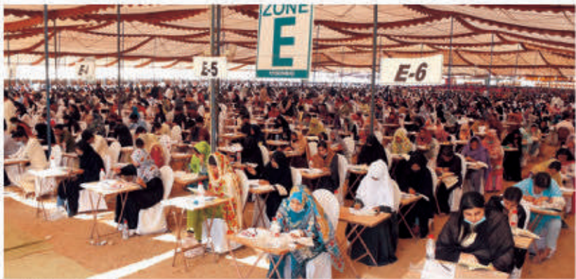
JAMSHORO: Large number of students solving the question paper during the Medical and Dental College Admission Test (MDCAT) held at LUMHS.

due to a slowdown in economic growth. Our bank is currently facing market risks, capital adequacy risks, credit risks, and liquidity risks due to changes in market variables such as high interest rates, foreign exchange volatility, dwindling stocks and high commodity prices. Q: How does political uncertainty affect the investment environment in the country? A: Political stability is a prerequisite for an economy to grow sustainably and restore investors' confidence to put their money in it. There must be a stable political environment in the country so that investors can be assured that their investments would be protected. Political instability can negatively impact the economy/equity market, thus resulting in decreased profitability. Q: Why are banks' profits dwindling? What possible steps can banks take to offset the crunch? A: Heavy taxation has dwindled the net profits of the smaller banks though their before-tax margins are fine. However, creating new deposit products and increasing the current product. INP