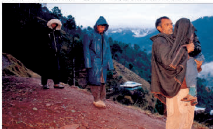
MUZAFFARABAD: A man covered his child with the warm shawl on their way during cool weather in the city.