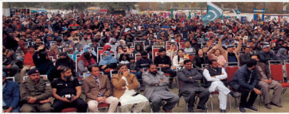
RAWALPINDI: Cricket fans react as they watch the ICC men's Twenty20 World Cup 2022 final cricket match between Pakistan and England, on a big screen at Ayub National Park, in the city.