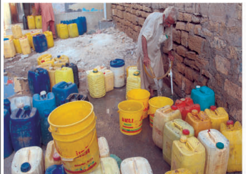
KARACHI: An old man is filling water cans for drinking water due to shortage of drinking water at Liyari area, in Provincial Capital.