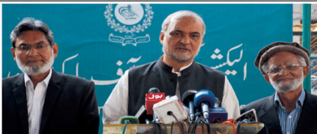
ISLAMABAD: Ameer Jamat-e-Islami Karachi Hafiz Naeem-Ur-Rehman talking with the media persons outside Election Commission of Pakistan in Federal Capital.

Around 300 exhibitors from 32 countries display their latest and innovative products while more than 500 national and international delegates are taking part in the exhibition, the state-run radio service reported. Apart from the six halls of the expo centre, three marquees have also been set up, one of which has been named after Kashmir. The 10th edition of IDEAS in 2018 had some 45 countries exhibiting their products and this year that number has grown to 64. Meanwhile, Prime Minister Shehbaz Sharif tweeted that the IDEAS had evolved into a platform that highlighted Pakistan's growing footprint in the global defence market. Around 300 exhibitors from 32 countries display their latest and innovative products while more than 500 national and international delegates are taking part in the exhibition, the state-run radio service reported. INP