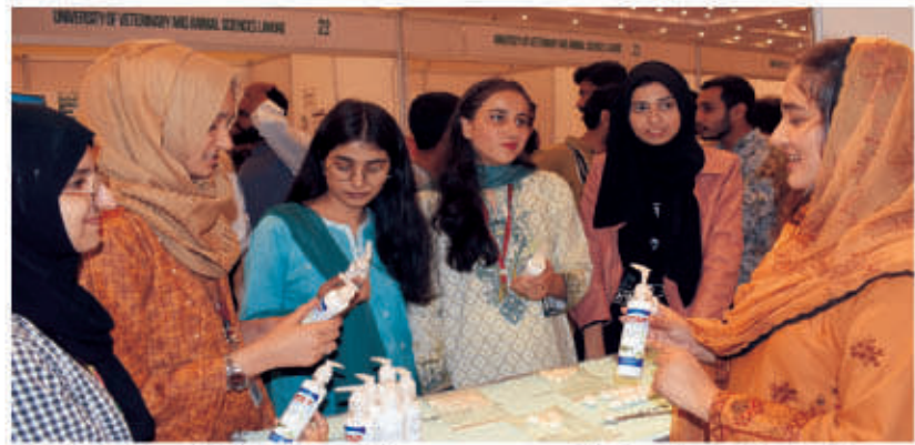
LAHORE: Girl are visiting on a stall during All Pakistan Universities Innovation Expo at a local hotel in Provincial Capital.

(MUNIR AHMED MARRI) JUDGE Banking Court Balochistan Quetta