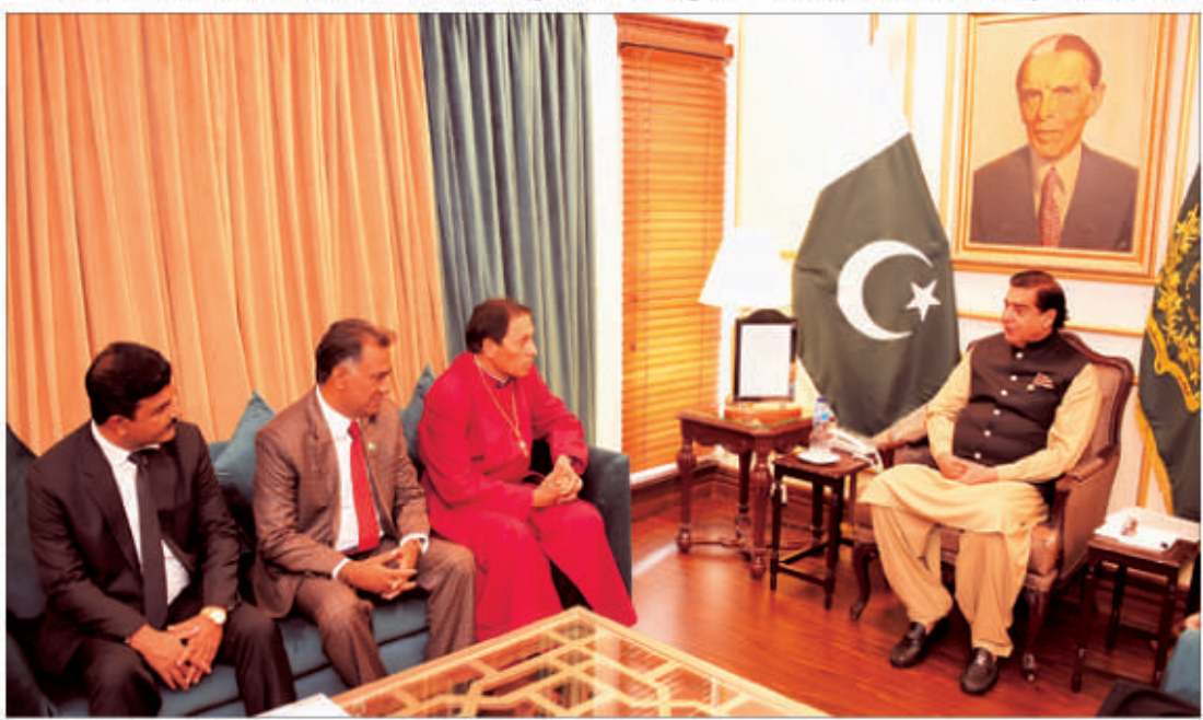
ISLAMABAD: Speaker National Assembly Raja Pervaiz Ashraf in a meeting with Representatives of Christian Community.