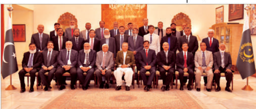
ISLAMABAD: President Dr. Arif Alvi in a group photo with the participants to the Senior officers, Leadership Course of National Command Authority, at Alwan-e-Sadr.