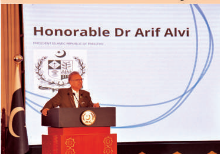
ISLAMABAD: President Dr Arif Alvi addressing a ceremony to commemorate World Diabetes Day: at Aiwan-e-Sadr.