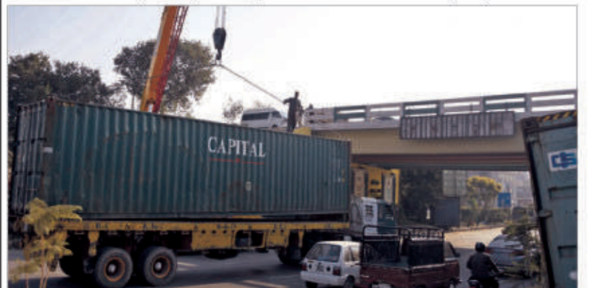
ISLAMABAD: Workers busy in removing heavy containers with the help of Crain as open roads at Faizabad after the PTI long march in Rawalpindi.

the charge of using indecent language against the state institutions. A three-member FIA team raided Swati's farmhouse in Chak Shahzad for uploading controversial posts on Twitter and took him into custody. This was the second time that the PTI leader was arrested in less than two months by the FIA officers for his controversial tweets. He was previously arrested by the FIA in October. An FIR was registered against Swati under Sec 20 of the Prevention of Electronic Crime Act 2016 (Peca) which deals with offences against dignity of a person as well as Sections 131 (abetting mutiny or attempting to seduce a soldier from his duty), 500 (punishment for defamation), 501 (defamation and printing of content deemed defamatory), Section 505 (statement conducing to public mischief) and 109 (abetment) of the Pakistan Penal Code (PPC). INP