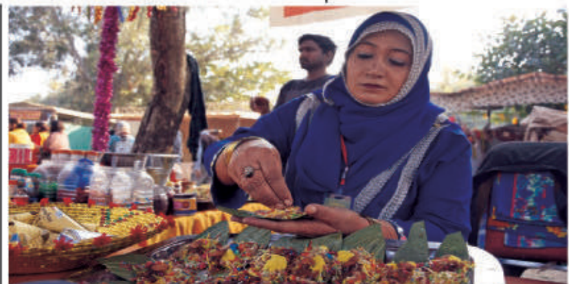
ISLAMABAD: A woman preparing traditional food item Paan at her stall in Punjab Pavilion during annual Lok Mela at Lok Virsa in Federal Capital.