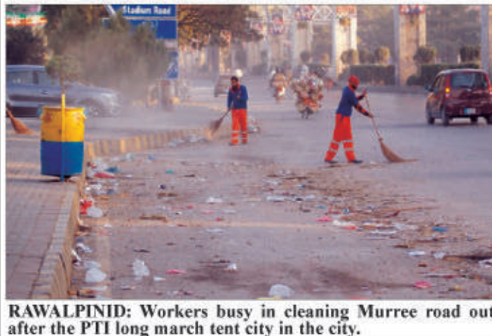
RAWALPINDI: Workers busy in cleaning Murree road outside Allama Iqbal Park after the PTI long march tent city in the city.