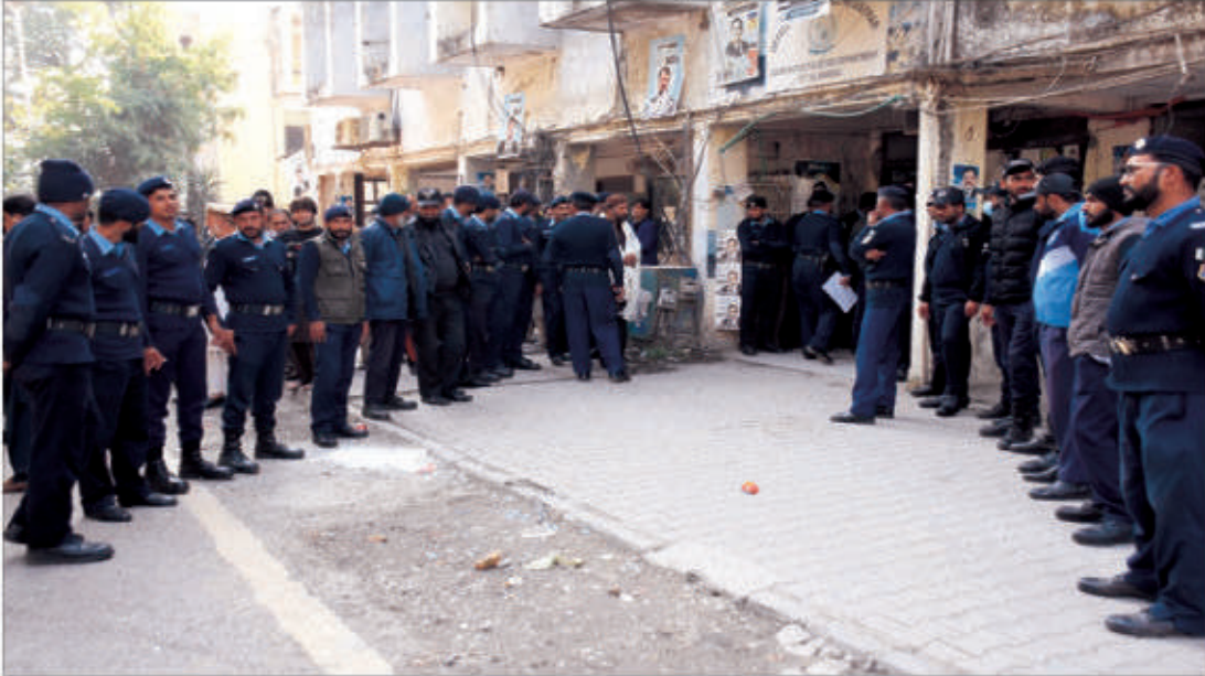
ISLAMABAD: Police personals stand alert outside local court during leader of PTI senator Azam Khan Swati hearing in Federal Capital, As Court sends Swati on physical remand in controversial tweets case.

away from political affairs and only this would give guarantee a strong and prosperous Pakistan. He said currently Pakistan was facing a serious financial crisis and that the political leaders should focus on finding a permanent solution to this. Achakzai urged party workers to ensure discipline and unity among their ranks and struggle for the acquisition of Pashtoon rights.