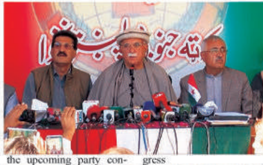
the upcoming party congress