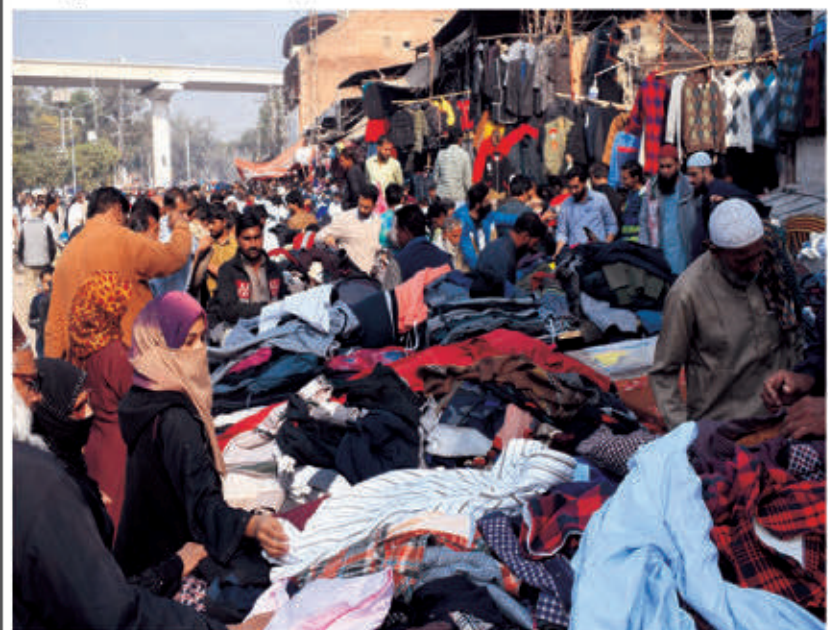
LAHORE: People are busy in buying warm clothes in a Landa Bazaar at Haji Camp area in Provincial Capital.

A session of the parliamentary leaders of the opposition parties in KP assembly will discuss various options to avoid dissolution of the legislature. "The opposition could mull over bringing a no-confidence motion against Chief Minister Mahmood Khan," Awami National Party's parliamentary leader Sardar Babak Khan has said. INP