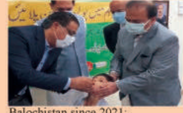
Balochistan since 2021:

Poliovirus can target those children who are deprived of polio drops. No Polio Case Reported in