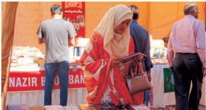
KARACHI: A girl is busy in buying books on a stall during Adab Festival at Frere Hall in Provincial Capital.

According to details, the PML-N leader has said that they have decided to file a motion of no confidence against the CM. They could also file a motion of no confidence or impose a governor rule in Khyber Pakhtunkhwa (KP), he added. INP