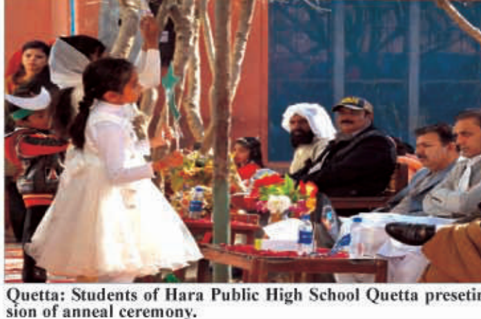
Quetta: Students of Hara Public High School Quetta presenting a tableau on the occasion of annual ceremony.

He added the opposition is as important as the government in the assembly. "Being a speaker I would like that every assembly completes its tenure." INP