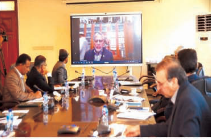
Islamabad: Federal Minister for Finance and Revenue Senator Mohammad Ishaq Dar Presided over the meeting of the Economic Coordination Committee (ECC) of the Cabinet, virtually through Zoom.

"We oppose the passage of this resolution and it is an injustice to the people of Balochistan", Malik Naseer Shahwani, the parliamentary leader of the BNP Mengal in the Balochistan Assembly told reporters after the session. He said the lawmakers were not informed about the tabling of the resolution in the Balochistan Assembly session.