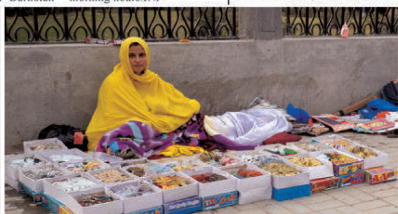
PESHAWAR: A woman vendor is selling bangles alongside a road at Jinnah Park and waiting for customers in Provincial Capital.

KARACHI: Over 11,000 candidates participated in the entrance test conducted for the admission to University of Karachi for the year 2023. The test was organized for admission in Doctor of Pharmacy, Doctor of Physical Therapy, BE, BS and Bed (Hons) program. Students and their parents were transported from the entrance gates to the examination centers through points buses. As many as 28 examination centers have been established in various departments of the University of Karachi for the entrance test.