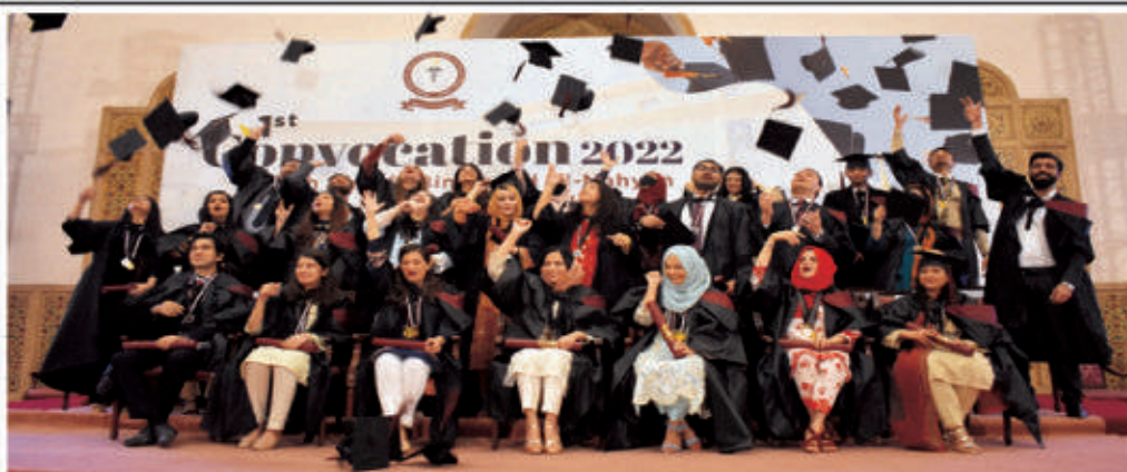
LAHORE: Students throwing their caps in the air during 1st Convocation 2022 of Shaikh Khalifa Zayed Al-Nahyan Medical and Dental College.

adopted a joint action plan on Kashmir issue. Under the plan, the OIC countries agreed to raise the Kashmir dispute in their bilateral engagements with India and underscore respect for the fundamental human rights of the Kashmiri people, as well as lend support to monitor human rights violations in the IIOJK. On May 16, 2022, the OIC General Secretariat expressed deep concern over India's attempts to redraw the electoral boundaries of the IIOJK altering INP