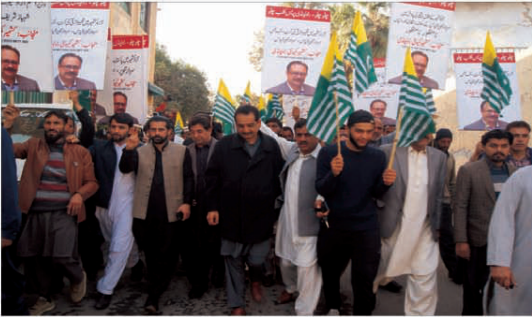
RAWALPINDI: Members of Kashmir Community shouting slogans during protest in favor of their demands outside press club in the city.