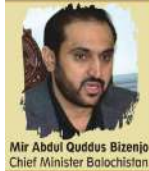
Mir Abdul Quddus Bizenjo Chief Minister Balochistan

Chief Minister Balochistan, Mir Quddus Bizenjo has termed climate change as a looming threat to the world in general and Pakistan in particular. In a message, Mr. Bizenjo stated that his government was taking all possible steps to mitigate the impacts of global warming and climate change in Balochistan. He stated that Balochistan has recently faced the brunt of climate change and global warming. The CM said the government was committed to rehabilitating all floods-affected people across Balochistan. Despite all odds, the present government succeeded in restoring the communication network and provided all basic facilities to the flood affected people.