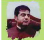
Ali Akbar Baloch Minister C&W Deptt:

Sardar Abdul Rehman Khetran, Balochistan Minister for Communication and Works said the present government was determined to connect all parts of the province through the construction of roads. In his message, Sardar Khetran said the government ensures the timely and quality construction of roads and buildings throughout the province. He said recent flash floods unleashed by heavy rainfall severely affected the communication structure in Balochistan. The Minister appreciated the efforts of the officers and employees of the C&W department for their efforts to restore the damaged and affected communication system.