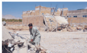
Carrying the Holy Quran, I stayed for a while in the backyard of my home...