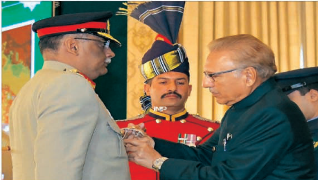
ISLAMABAD: President Dr. Arif Alvi conferring the award of Nishan-i-Imtiaz (Military) upon the Chairman Joint Chiefs of Staff Committee (CJCS), General Sahir Shamsah Mirza at a special investiture ceremony held at Aiwan-e-Sadr.