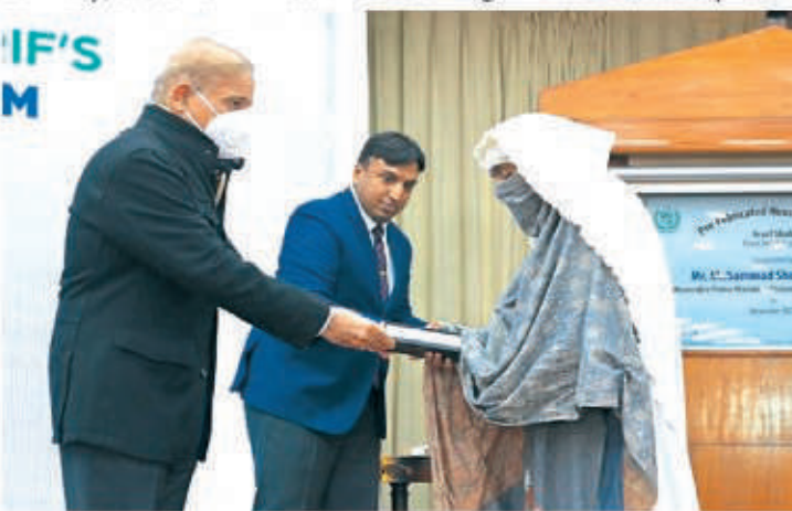
ISLAMABAD: Prime Minister Shehbaz Sharif distributing keys of newly built houses among the flood affectees of Tank at the inaugural ceremony of insaf shah pre-fabricated housing project donated for the by Menzies Aviation Group and SPARS Group.

previous record in relation to the recruitments is with the former DG of Agriculture, which he handed over to the court on the occasion of his appearance in the court, besides, the date of applications for recruitment to the said posts has been extended up to 9 December 2022, was done. The bench ordered the department to stop the recruitment till the next hearing i.e. December 21, 2022 in order to save the case from further complications and controversy and to protect the legal rights of the candidates.