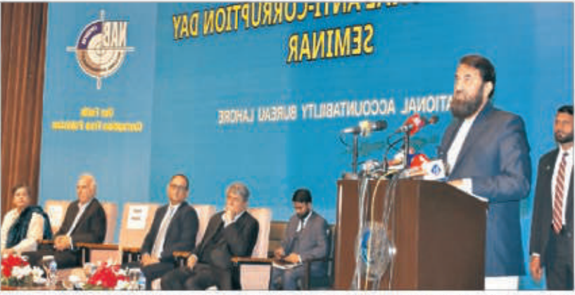
LAHORE: Governor of the Punjab Baligh Ur Rehman addressing a seminar on international anti-Corruption Day organized by NAB Lahore.