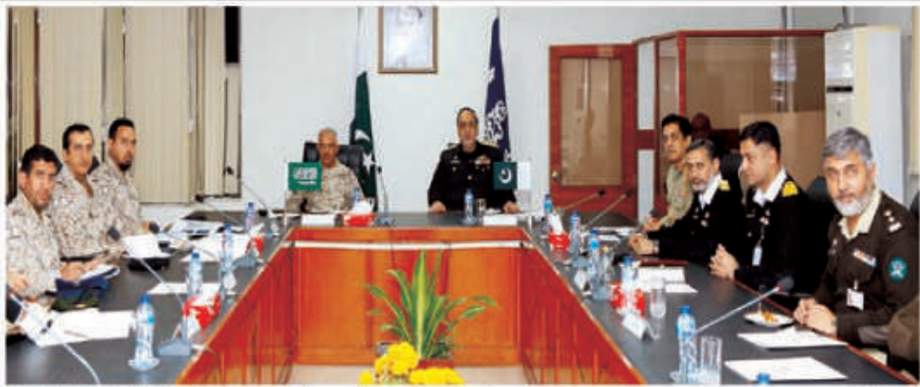
ISLAMABAD: Brief session for Royal Saudi Naval delegation upon visit of Naval Headquarter.

Shangla and Kohistan districts Besides, shallow fog in isolated pockets is likely to occur over Swabi, Mardan, Nowshera, Charsadda, Peshawar and Dera Ismail Khan districts, as well as Peshawar to Swabi motorway during late night and morning hours.