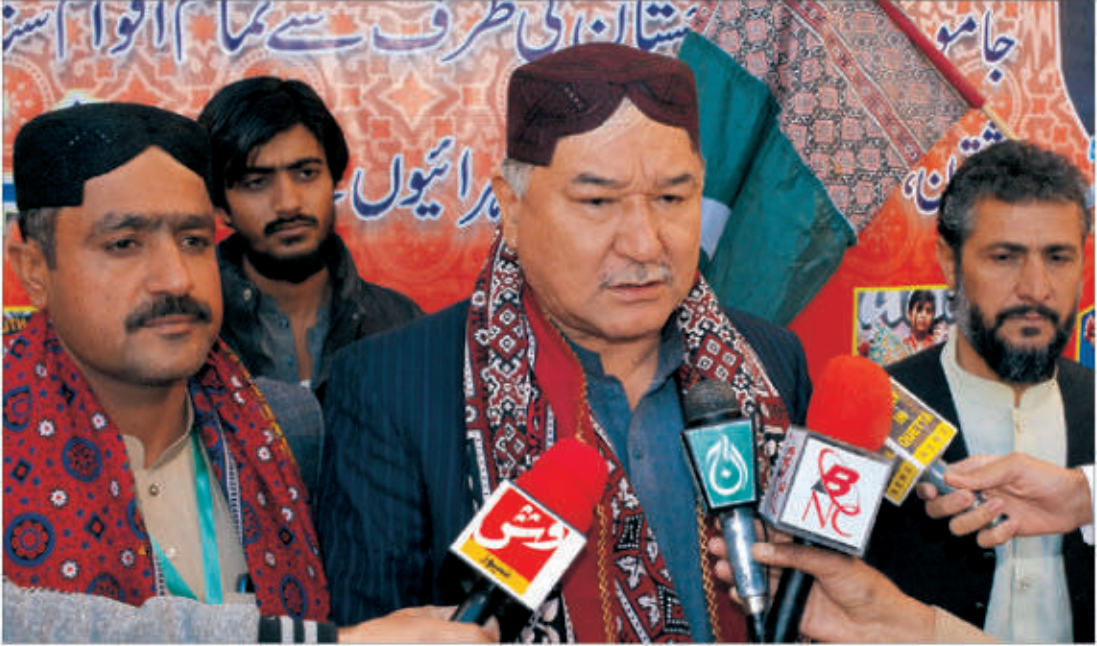
QUETTA: Provincial Minister for Culture Abdul Khaliq Hazara talking with media on the occasion of Sidhi Culture Day on behalf of Balochistan.