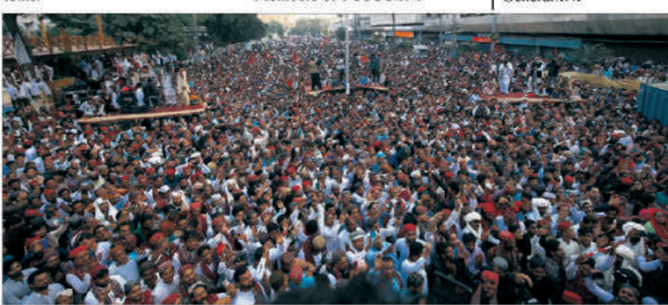
KARACHI: A large number of people attending the celebrations of Sindh Ajrak Topi Culture Day.