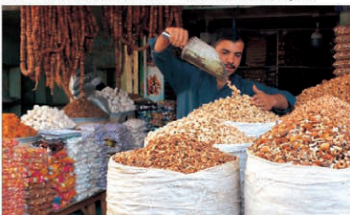
QUETTA: Shopkeeper displaying dry fruits in his shop to attract customers.

Established in 1974, Toshakhana is a department under the administrative control of the Cabinet Division and stores precious gifts given to rulers, parliamentarians, bureaucrats and officials by heads of other governments, states and foreign dignitaries as a goodwill gesture. It has valuables ranging from bulletproof cars, gold-plated souvenirs, expensive paintings to watches, ornaments, rugs and swords. The existence of the Toshakhana represents a very standard practice in global diplomacy. Whenever the leaders of two countries meet, it is customary to exchange gifts. In most democratic states, however, these gifts are considered the property of the state and received by individuals on behalf of the country. INP