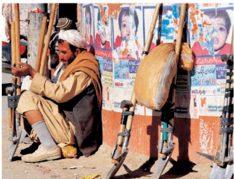
QUETTA: Daily wages labor sitting with their work tools alongside while waiting some work.