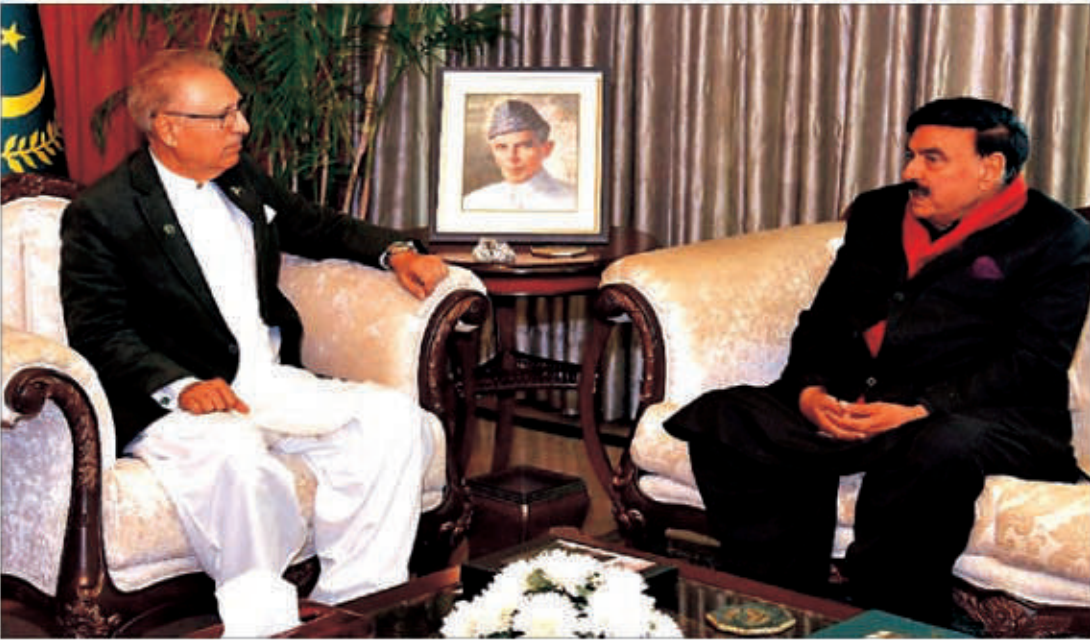
ISLAMABAD: Former Interior Minister Sheikh Rasheed Ahmad called on President Dr Arif Alvi at the Aiwan-e-Sadr.

The secretary housing and works informed the committee that we have held meetings with the main guarantor owner of the disputed land. The committee also suggested constituting committee having two senior members from the Ministry of Housing and Works which was acknowledged by senior Joint Secretary Housing and works. The committee recommended expediting the resolution of the matter in consultation with the committee members. The matter of briefing of the Director General (Estate) regarding detail of commercial Properties leased out