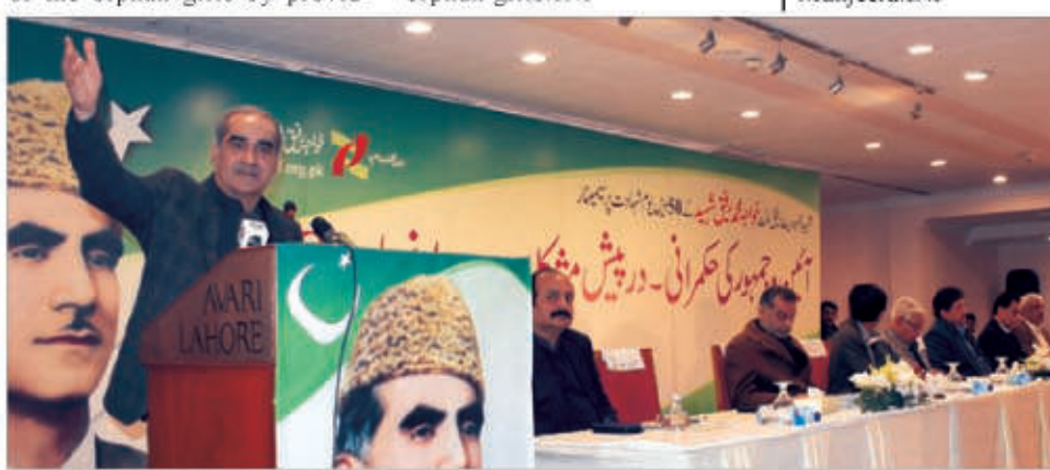
LAHORE: Federal Minister for Railways Khawaja Saad Rafique addressing during death 50th anniversary of late Khuwaja Muhammad Rafique at a local hotel.

ANF Sindh in Sindh province, the force recovered 108.39 kg drugs, 88.730 kg suspected substance and 31 bottle branded alcohol in 7 operations while arrested 4 accused persons including a woman involved in drug smuggling. Online