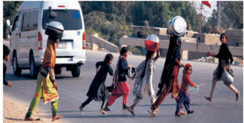
HYDERABAD: Women crossing the road after washing clothes in the Karachi Canal.

Hand donation is not an option that can be selected from the donor register. Finding a match is more complex than for other organs as physical look and psychological acceptance play a key role in transplant success. A one-year assessment of the patient is key and includes psychological as well as immunological assessment. Recovery and full usage of the new transplants can take between one and three years. Hand transplant is not yet available for children, but this is an area the team aims to develop. Only after intense psychological interviews, did he go under the surgeon's knife. "They test your psychological being to see if you're suitable," he says. On Boxing Day, the call he and his family had been waiting for finally came. "They said, 'can you come across?' They said you might spend a while in hospital while we do the tests to see if you're suitable. All sorts. INP