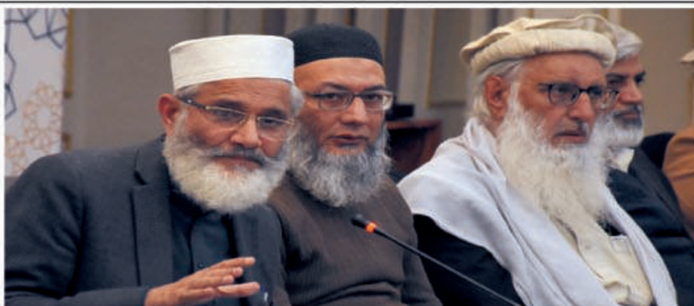
ISLAMABAD: chief of Jamaat-e-Islami, Siraj ul Haq addressing during a National seminar Hurmat-e-Sood at a local hotel in Federal Capital.

in this case contrary to the facts, the written order stated. The AC written order stated that according to Suleman Shehbaz if he is arrested, this will cause unprecedented damage to him. Earlier, the Islamabad High Court (IHC) stopped the Federal Investigation Agency (FIA) from arresting Suleman Shehbaz, son of Prime Minister Shehbaz Sharif upon his arrival from London. INP