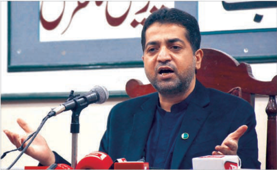
QUETTA: Home Minister Balochistan Mir Zia Lango addressing a press conference.

The reason behind gas shortage is the high demand and low supply, forcing the gas suppliers to cut off the supply compulsorily at multiple times of the day. INP