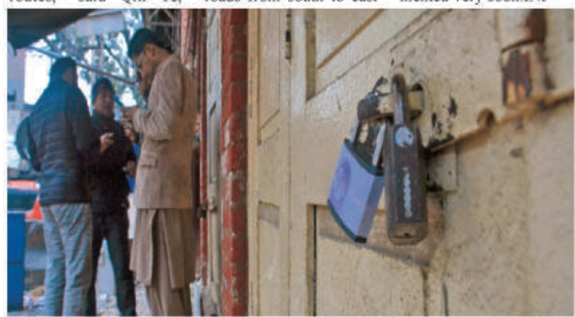
RAWALPINDI: A view of sealed Lal Haveli from Evacuee Trust Property Board (ETPB), in the city.

Ghulam also noted that as CPEC enters its second phase of high-quality development, more partnerships, joint ventures, and travel are required. "CPEC is an excellent example of the two countries' friendship.