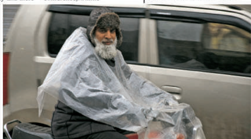
RAWALPINDI: A motorcyclist wearing plastic sheet to protect themselves from rain during heavy rain in morning hours at a road.

Shehbaz Sharif said terrorists want to create fear by targeting those who are rendering the duty of defending Pakistan. The Prime Minister reaffirmed Pakistan's firm commitment to root out terrorism. He said the entire nation and institutions are united and unified for the eradication of terrorism. He said the entire nation salutes its martyrs. Shehbaz Sharif said a comprehensive strategy will be adopted on the deteriorating law and order situation in Khyber Pakhtunkhwa. The center will cooperate in increasing the anti-terrorism capacity of the provinces. Shehbaz Sharif said the Interior Minister has been instructed to provide assistance in increasing the capacity of the counter-terrorism departments of the provinces, especially that of Khyber Pakhtunkhwa. Commiserating. INP