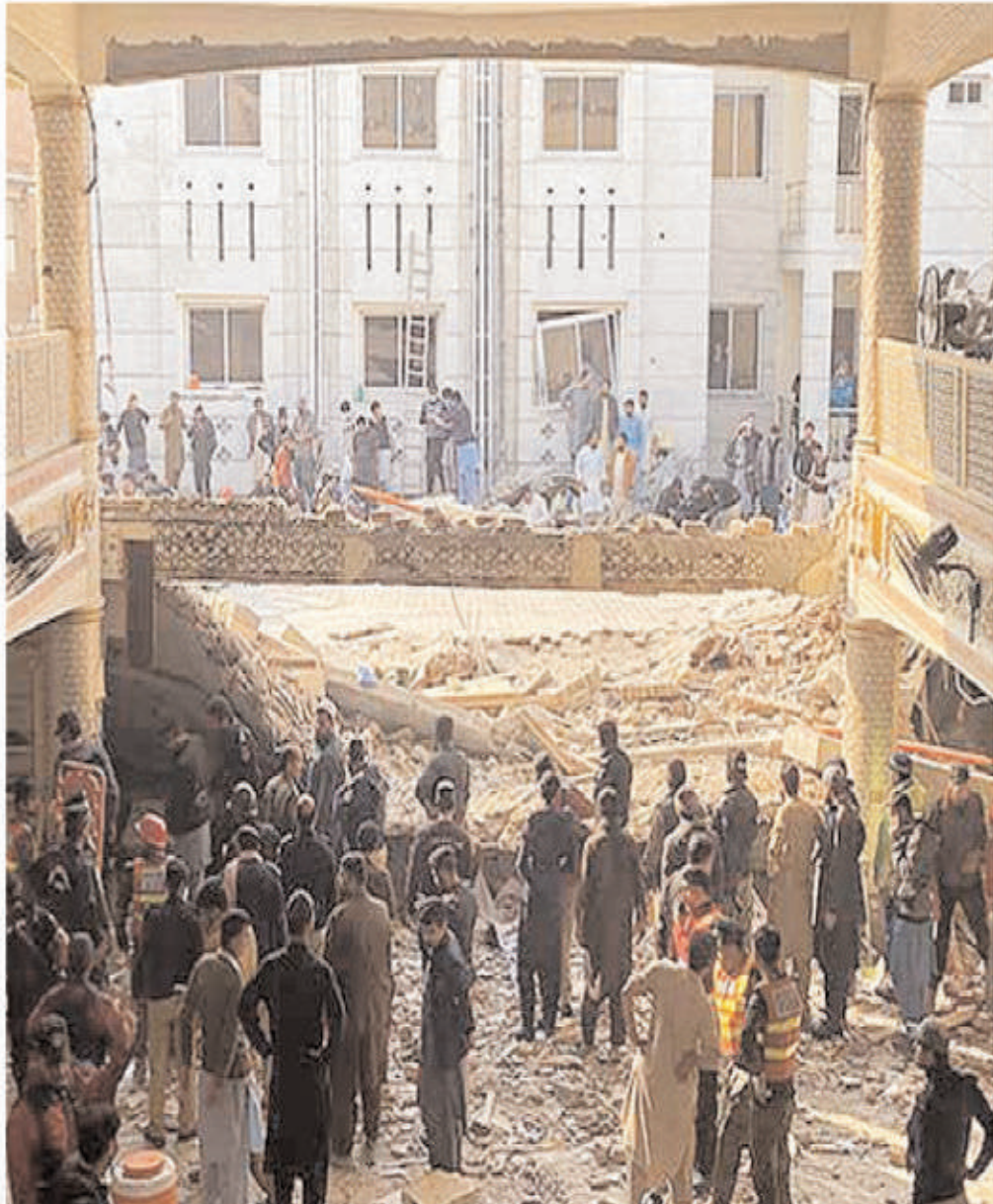
first row of the Police Lines Mosque in Peshawar blew himself as soon as the prayers started.