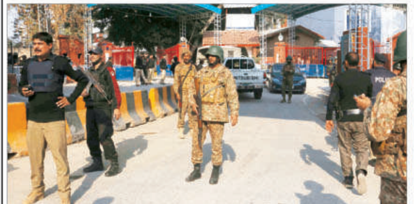
PESHAWAR: Security personnel stands alert outside police headquarters after the blast in Provincial Capital.

During the inspection, the hall owners and management were asked to comply with the government orders of closing the programmes till 10:00 p.m. INP