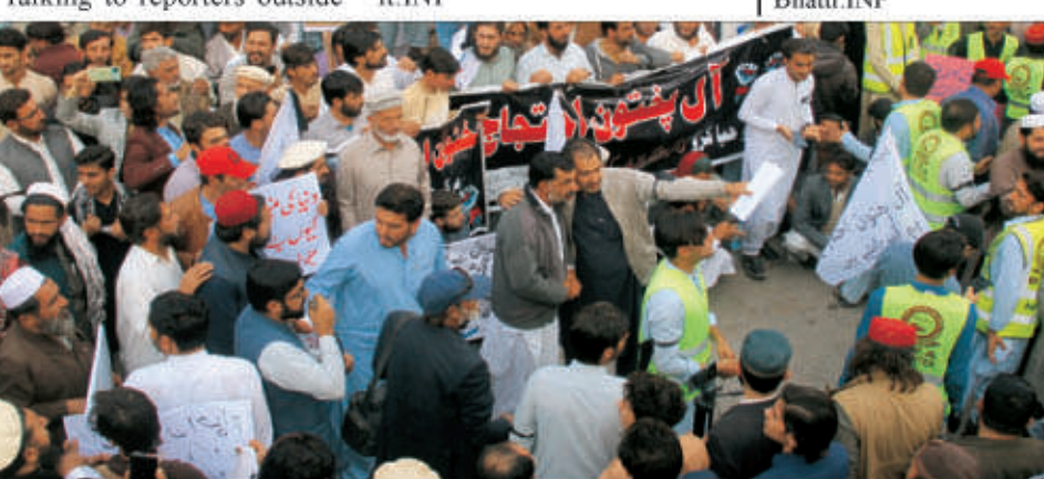
KARACHI: Activists of Swat Kohistan hold a protest in favor of their demands outside press club in Provincial Capital.

He said that diesel is used in transportation and agricultural sectors while a big jump in its price would increase transportation cost of goods and agricultural products causing more inflation, especially for low-income people. Moreover, the hike in the price of petrol would also increase transport fares that would bring more misery to the already inflation-stricken people. The ICCI Acting President said that an artificial shortage of petrol and diesel was being created in the market as the oil marketing companies (OMCs) were not distributing them to the petrol pumps and this situation can cause unnecessary. INP