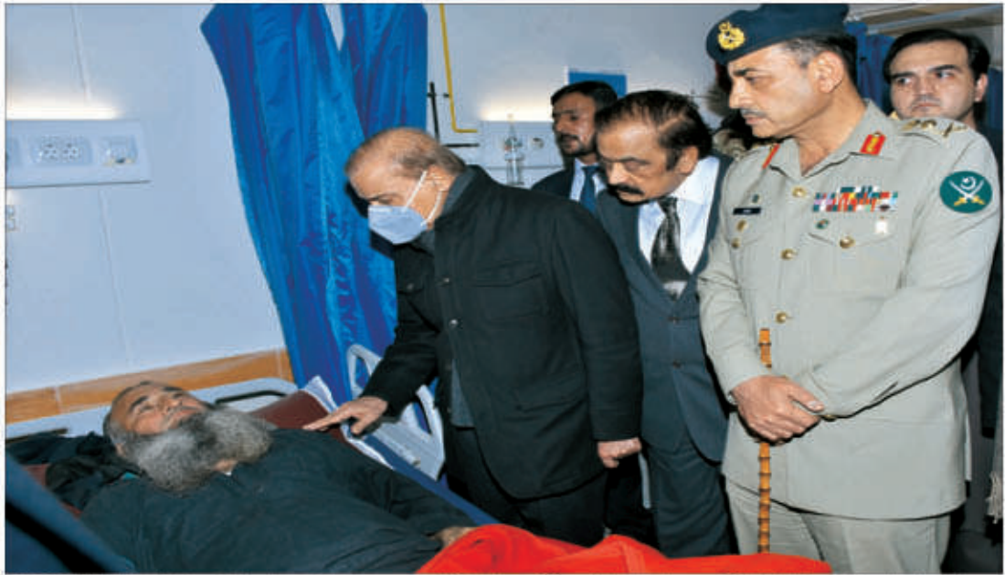
PESHAWAR: Prime Minister Muhammad Shehbaz Sharif and Army Chief Asim Munir, inquire about an injured victim at Lady Reading Hospital, after a mosque blast inside the police headquarters, in Provincial Capital.

It directed Imran to render an unconditional apology to Zardari "on television, print and social media, within 14 (fourteen) days from the receipt of this notice." Should Imran fail to do so, appropriate legal proceedings would be initiated against him including civil as well as criminal, before the competent courts of law in Pakistan and England. A suit for damages for Rs10 billion would be liable to be paid. INP