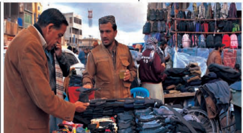
QUETTA: A man buying warm items from roadside vendor.

The PTAs report released on Tuesday highlighted encouraging telecom statistics and expanding usage of telecom services across Pakistan due to a progressive and enabling regulatory environment despite a challenging year marked by rising inflationary pressures and profitability concerns. Pakistan has over 197 million telecom subscribers (fixed and mobile), with tele-density touching 90%. Moreover, biometrically verified SIMs/subscribers increased to 194 million, whereas, broadband subscription grew to 124 million with 56% penetration and annual mobile data usage touching 8,970 petabytes (6.8 GB per subscriber, per month), showing annual growth of 31%.INP