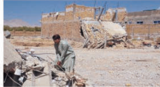
Technical staff engaged in clearing of the highway in Bolan Balochistan: Photo taken from social media