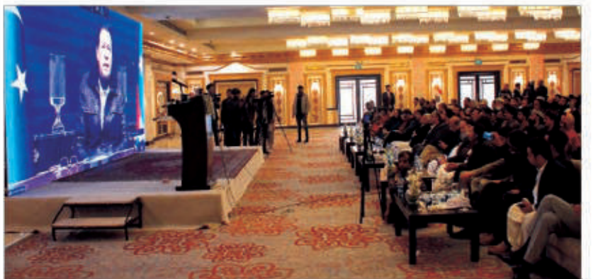
ISLAMABAD: Chairman Pakistan Tehreek-e-Insaf Imran Khan addressing via video link during a National Seminar on Terrorism 2.0 organized by PTI KPK at local hotel.

million Euros and 36 million pounds which is approximately PKR 2204 billion. Faisal Kundi said that the funds acquired through pledges would be spent on the reconstruction and rehabilitation of the flood affected areas and people across the country. The way Bilawal Bhutto fought the case of Pakistan at international forums by visiting different countries and inviting United Nation Secretary General to Pakistan for creating awareness and sense of sympathy about the flood damages which reflected his diplomatic wisdom, he said. He said that still water had not receded from many of the flood affected parts of the country including Sindh, Balochistan, South Khyber Pakhtunkhwa and South Punjab.