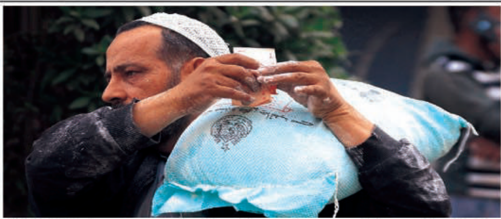
KARACHI: A man carrying flour bag going toward home after buying Government subsidized flour from delivery truck.

The export consignments are affecting due to the conditional permission, said the company, adding that the restriction damaged the inventory. Previously.INP