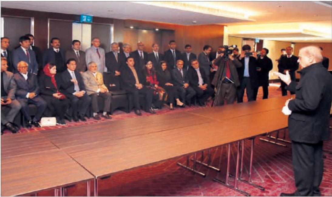
GENEVA: Prime Minister Shehbaz Sharif addressing Pakistani delegation and officer of Pakistani Mission in Geneva.

resources to rehabilitate flood victims and rebuild infrastructure and this is a great achievement of Pakistan", Senator Sherry Rehman said. The Minister underscored that in this entire process, the continuous efforts of UN Secretary General Antonio Guterres were appreciable. "After the floods, he emerged as the voice of vulnerable and affected people in Pakistan at the global level," Sherry Rehman said. She added that the first priority of the government was to give back their homes and livelihoods to the flood victims. "We are constantly struggling in this regard and will not rest until the complete success of this mission", Sherry Rehman said. The Minister also lambasted the Pakistan Tehreek-e-Insaf (PTI) leadership. "On the other hand, one party (PTI) in the country is constantly busy creating chaos and uncertainty. The world is seeing how different our priorities are from that of this party," Sherry Rehman said.