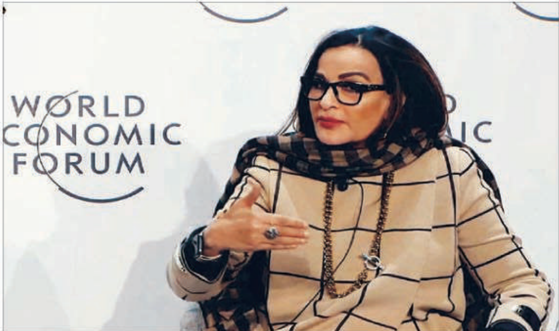
DAVOS: Federal Minister for Climate Change, Senator Sherry Rehman speaking in a panel discussion in WEF annual meeting in Davos.

Emirati envoy in Washington Yousef Al Otaiba had in 2021 acknowledged that his country had helped in managing escalation over Kashmir. Web Desk