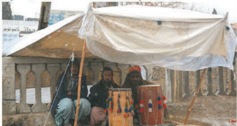
QUETTA: Traditional folk performer sit under temporary setup during rain in provincial capital.

The ISPR said that the militants used Iranian soil to "target a convoy of security forces patrolling along the border". Iran has been asked to hunt down the terrorists on their side, the ISPR statement said. INP