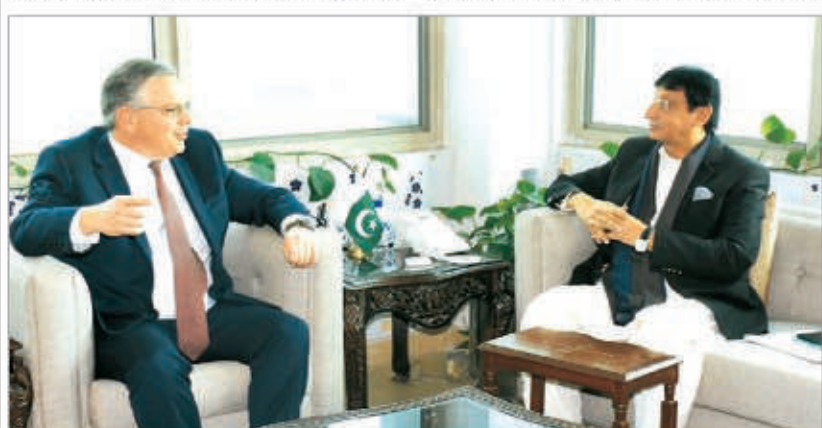
ISLAMABAD: US Ambassador to Pakistan Donald Blome calls on Federal Minister for IT and Telecommunication Amin Ul Haque.