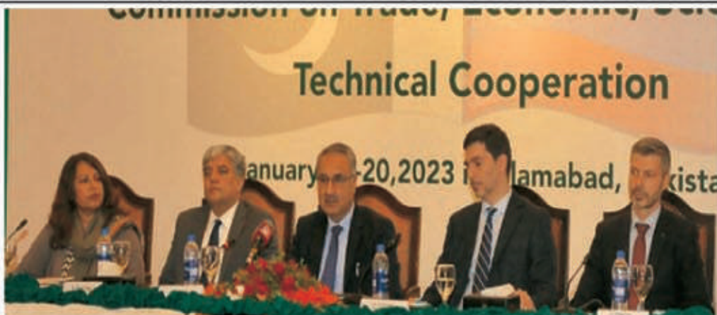
ISLAMABAD: 8th meeting of the Pakistani-Russian Intergovernmental Commission on Trade, Economic, Scientific and Technical Cooperation has started.

For example, in the pharmaceutical industry, it is used to produce protein supplements and other medicines. It is used to cure high blood pressure and increased levels of cholesterol/lipids in the blood, diabetes, obesity, anemia, night blindness, pancreatitis, glaucoma, etc. New potential uses of spirulina include extraction of a valuable enzyme like Phosphoglycerate Kinase for ATP determination, use in immunodiagnoses as a phycobillin, and superoxide dismutase required in genetic engineering." Dr Asif said Spirulina's anti-oxidant properties prevent cancer possibilities, and its effect on skin nourishment has also paved the way for cosmetic formulations using this alga. "With fairly high nutritious value, Spirulina is favorable for fish growth and can be used as a complementary nourishing ingredient of feed for poultry, shrimps, fish, etc. It is also a cheap source to get very nutritious biofertilizers. INP