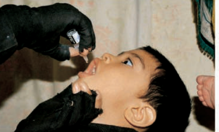
QUETTA: A health workers is administering Polio drops to children during Polio Campaign.

ISLAMABAD: Pakistan Meteorological Department (PMD) has said that a new rains spell will enter into Pakistan through Balochistan which will grip the upper part of the country. Due to new rains spell, rain-thunderstorm followed by snowfall over hills is expected at isolated places in upper Khyber Pakhtunkhwa, Kashmir, Gilgit Baltistan, north Punjab and north Balochistan. Temperature in Islamabad and Gilgit recorded on Friday morning was five degree centigrade, Lahore 12, Karachi 15, Peshawar 10, Quetta 02, Murree -02 and Muzaffarabad 08 degree centigrade. Meanwhile, the PMD has forecast cloudy weather with chances of rain for Indian Illegally Occupied Jammu and Kashmir and snow is expected in Srinagar, Leh, Pulwama, Anantnag, Shopian and Baramulla, cloudy with chances of rain in Jammu. Temperatures recorded Srinagar, Pulwama and Shopian on Friday morning was one degree centigrade, Jammu 09, Leh -11, Anantnag and Baramulla 02 degree centigrade. INP