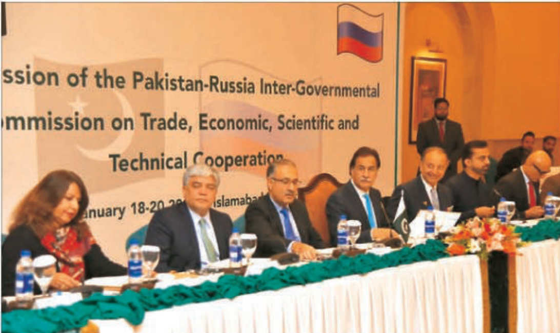
ISLAMABAD: Federal Minister for Economic Affairs Sardar Ayaz Sadiq and Minister of Energy of the Russian Federation Nikolay Shulgihin in narrow format meeting on the 8th Session of IGC.

The silver snow has covered the whole of Murree giving it a spectacular white look. According to the Meteorological Department's forecast, rain with thunder and lightning is expected at a few places in Upper Khyber Pakhtunkhwa, Kashmir, Gilgit Baltistan, North Punjab and North Balochistan and snowfall in the mountains on Friday. The Met Office has predicted that westerly winds are affecting North Balochistan which will cover the upper areas from January 21 (night) and will continue intermittently till January 25. However, the weather in the last 24 hours has been extremely cold and dry in most parts of the country. However, rain was recorded at a few places in Balochistan, Upper Sindh and South/Central Punjab. Highest rainfall (mm): Baluchistan: Gwadar 25, Jiwan 21, Panni 17, Turbat 11, Kalat 08, Panjgur 07, Quetta (Samingli 03, Sheikh Manda 01), Zhob 05, Sindh: Jacobabad 03, Sukkur 01, Punjab: 01 mm rain was recorded in Khanpur. The minimum temperature recorded today: Astur, Leh, Skardu minus 12, Kalam minus 10, Gopur minus 09, Bagrot minus 07, Malam Jabba minus 06, Ziarat, Parachinar, Deer minus 05 and Saydu Sharif recorded minus 04 degrees Celsius. INP