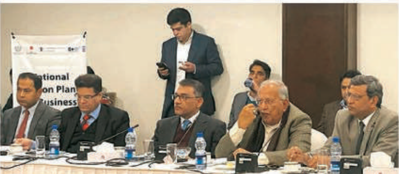
ISLAMABAD: Federal Minister for Human Rights, Mian Riaz Hussain Pirzada chaired the 3rd meeting of inter-ministerial and inter-provincial steering committee for National Action Plan on Business and Human Rights.

industrial production nor exports were possible without the large-scale imports of raw materials, machinery and parts. Aslam Khan said, "A nation that makes atomic bombs does not have the ability to make simple motorcycle engines or power looms. The agricultural country does not have the ability to manufacture tractors, basic agricultural equipment, chemicals, and parts, due to which pulses, vegetables, fruits, cotton, and wheat have to be imported." In Pakistan, all emphasis is placed on the development of property and the stock market, while industry and agriculture are neglected, he added. The Chairman PEW said that due to the lack of the required number of oil refineries to meet the country's needs, billions of dollars are being lost annually and this is a waste of resources. The wastage of resources continues and there are no signs of any change for the sake of Pakistan. INP