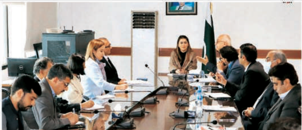
ISLAMABAD: Shazia Marri, Federal Minister, and Chairperson BISP, chairing a meeting with a World Bank delegation.

Tando Allah Yar, Met Office predicted. People have been advised to take precautionary measure during the cold wave. PMD forecast rainfall and snowfall on mountains in Upper Khyber Pakhtunkhwa, north-eastern Punjab, Islamabad, Kashmir and Gilgit Baltistan on Wednesday (today). Some areas in KP and Kashmir could receive moderate to heavy rainfall and snowfall. INP