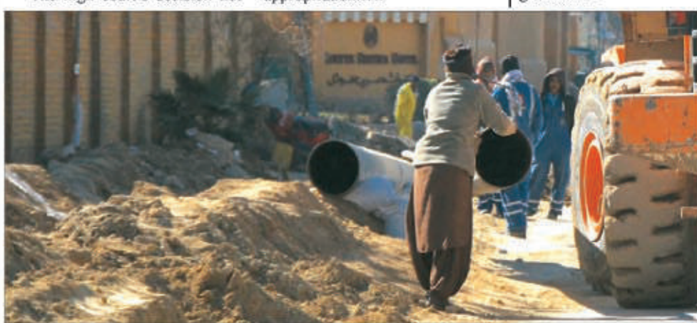
QUETTA: Labour busy in placing gas pipe line at Zarghon road.

The video shared on Farrukh Habib's official Twitter account shows the PTI leader was trying to obstruct the motorcade of security officials at a Kala Shah Kaku toll plaza. In the video, the former minister can be seen standing in front of police vehicle carrying Chaudhry.