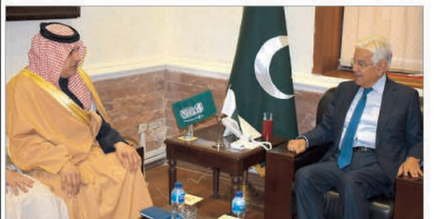
RAWALPINDI: Assistant Defense Minister for Saudi Arabia Talat Abdullah Alotaibi called on Federal Minister for Defence Khawaja Asif.

Gwadar relies on imported electricity from Iran and with the construction of the 132kV line, the port city will be connected to the National Grid for the first time.