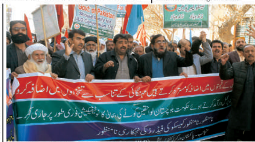
QUETTA: Pakistan Workers Federation Balochistan hold protest rally against prize hike.