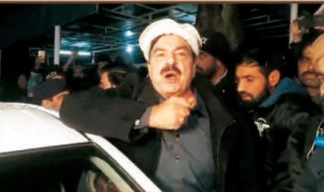
Muslim League (AML) chief Sheikh Rasheed Ahmed on two-day physical remand in a case registered against him for levelling allegations against former president Asif Ali Zardari. The Awami Muslim League