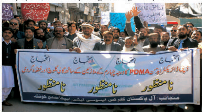
QUETTA: Activists of APCA Balochistan hold protest in favour of their demands.

She was addressing a ceremony through video-link, which was jointly organised by the Unique Group of Institutions (UGIs) and Aiwan-e-Iqbal at the college auditorium here. She said Kashmiris were offering sacrifices for decades to live in an independent country. He called upon the youth to play their role for liberation of Kashmir and exposing the Indian atrocities as well as propaganda before the world. She said Kashmiris and Pakistanis observe Kashmir Solidarity Day every year on February 5, across the world, but the Indian oppression of Kashmiris people was going on unabated. She regretted INP