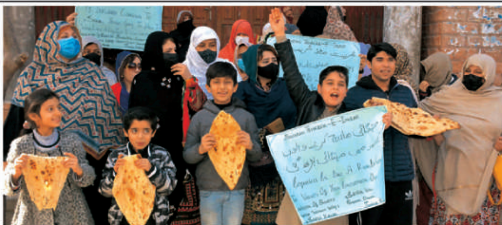
QUETTA: Activists of PTI woman wing hold protest against prize hike outside QPC.

and equipping Pakistani talent, by bringing together investors, innovators, entrepreneurs, thought leaders, and talented youth of Pakistan. The NICAT with strong government, industry, and academia linkages will help foster meaningful partnerships with aerospace, aviation and deep tech stakeholders, allowing startups to accelerate their growth.