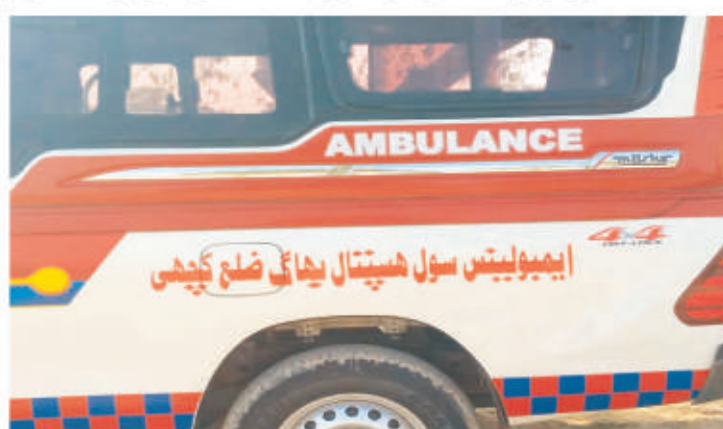
sary operations. Security was tightened in the area to avoid any other untoward incident. Similar incidents have claimed precious lives that occurred in other districts of Balochistan i.e. Musa Khail, Killa Abdulah, Ziarat, Zhob, etc.