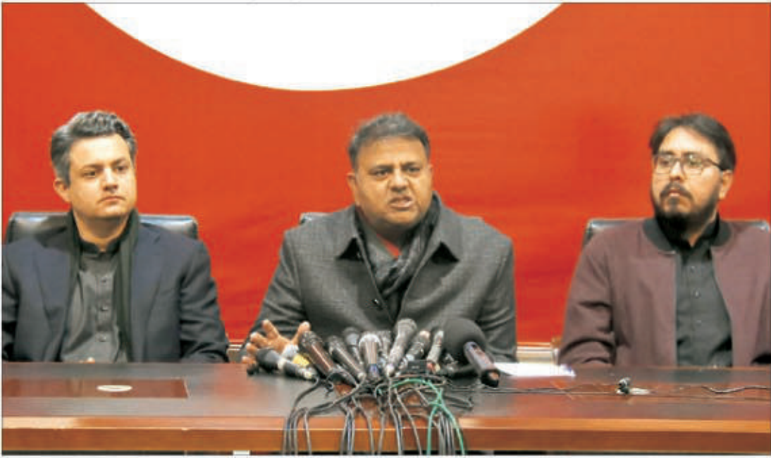
ISLAMABAD: Senior Vice President Tehreek-e-Insaf Chaudhry Fawad Hussain along with Senior PTI leader Shahbaz Gill and Hammad Azhar at PTI Secretariat G-8.

According to the Ministry of Climate Change, these investments are insufficient to curb the climate crisis in Pakistan. As per the updated NDC targets set in 2021, the country requires at least $101 billion for energy transition by 2030. According to the SDPI report, acquiring green finance in Pakistan is contingent on overcoming the challenges associated with the development and implementation of green financing mechanisms. The report pointed out that for a struggling economy like Pakistan, green finance represents a lifeline that can support the development goals while reducing its vulnerability and contribution to climate change. The report highlighted that Pakistan must make significant efforts on this front, as inaction will likely push the country back in the global competition. Given the country's economic situation and institutional capacities, the effective strategy would be to take small, calculated steps forward, it added. According to the report, the first 6-12 months of the process should be spent planning and preparing for the road ahead. Pakistan must overcome inefficiencies and challenges in its industrial, financial, and legislative sectors, it added. Based on the report, the government should develop a concrete strategy for closing down fossil-fuel-based power plants and reaffirm its commitment to a just energy transition in order to gain credibility in the eyes of international investors. INP