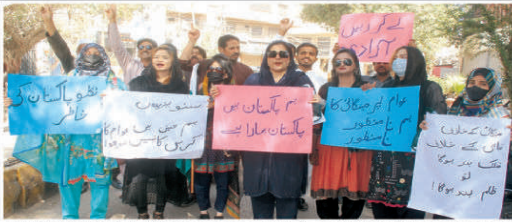
HYDERABAD: Social Workers hold a protest against inflation, outside press club in the city.

Company Profile KSB Pumps Company Limited is a foundry-based engineering firm engaged in manufacturing and selling industrial pumps, valves, castings and related parts. The company is a supplier of pumps, valves, and related systems for industrial applications, building services, process engineering, energy conversion, water treatment, water transport, solids transport, and other areas of application. Its products include Zoro Stainless Steel Submersible Pump, which is made of corrosion and abrasion-resistant stainless steel; Macht - IEC Low Voltage Induction Motor, which is suitable for driving various kinds of machines or equipment, and Macht - KSB Submersible Motor, which is designed to drive water submersible pump and bears a waterproof design. The company caters to customers in the water, sewage, oil, energy, industry and construction sectors. INP