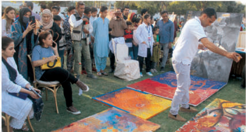
KARACHI: An artist busy in painting during Art for Peace Workshop at Frere Hall in Provincial Capital.

MUZAFFARABAD: International Forum for Justice Human Rights Jammu and Kashmir, organized Quran Khwani in Muzaffarabad in connection with the martyrdom anniversaries of Muhammad Maqbool Butt and Muhammad Afzal Guru. Muhammad Afzal Guru in the same jail on February 09 in 2013 for their role in Kashmir freedom movement. Their bodies remain buried in the premises of the jail. Speaking on the occasion, Vice Chairman.