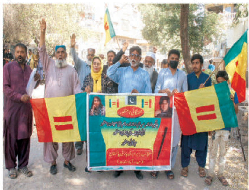
HYDERABAD: Workers of Barabri Party Pakistan hold a protest rally against inflation, outside press club in the city.

holders in June 2021 approved the sale of Saif Cement Limited's (SCL) assets in order to invest in Saif Power Limited keeping in view the latter's dwindling profits. Revenues from the sale of SCL assets will also be used to pay dividends to investors of Saif Power Limited. Industry Comparison Nishat Power, Altern Energy, Kohinoor Energy, and Lalpur Power are considered rivals of Saif Power Limited, which has the highest market capitalisation of Rs7.2 billion among its competitors. Profitability The net profit and gross profit margins of the company remained healthy in 2019 and 2020, but dipped in 2021 as is shown in the graph below. The profitability score is a useful metric for determining how desirable a stock is. Saif Power Ltd displays a profitability score of 8, which is much greater than that of its peer group. Company Profile Saif Power Limited was incorporated in Pakistan on November 11, 2004, as a public limited company under the now repealed. INP