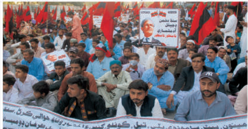
KARACHI: Activists of Awami Tehreek hold a protest rally in favor of their demands outside press club in Provincial Capital.

ISLAMABAD: A 10-member medical team from Pakistan left for earthquake-affected Turkiye on Sunday to take part in the ongoing relief operations in the quake-hit areas. According to the health ministry spokesperson, another medical team of 10 doctors from the Pakistan Institute of Medical Sciences (PIMS) is set to leave for Syria later today. He said that a ten-member medical team of PIMS along with the medicines left for Turkiye, while a separate 10-member doctors' team will leave for Syria today's evening. Minister for National Health Services Abdul Qadir Patel extended heartfelt sympathies to the brotherly Turkiye and Syrian people on the human and material loss in the wake of the recent devastating earthquake. He said that Turkiye has always helped Pakistan and Islamabad will also not leave Turkiye at this testing time and will provide every possible support. He said that the medical team will serve the earthquake victims with full dedication and commitment in both countries. INP