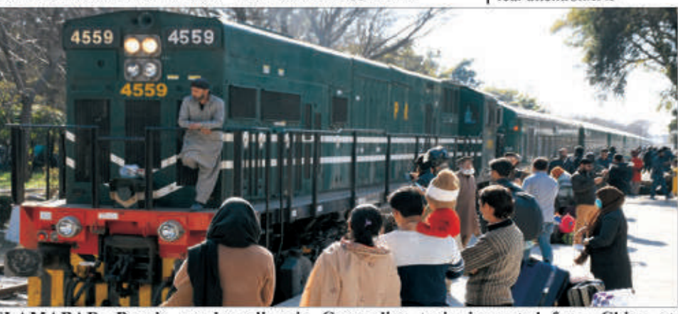
ISLAMABAD: People are boarding in Green line train imported from China at Margalla Railway Station in Federal Capital.