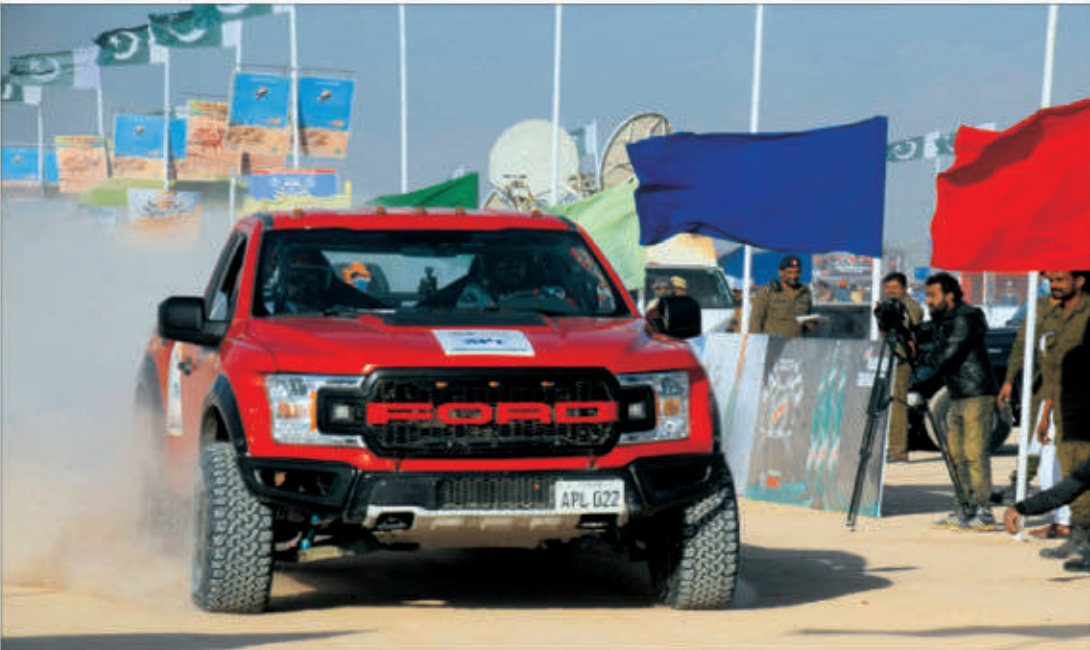
BAHWALPUR: A Pakistani driver powers his vehicle during the 18th International Cholistan Desert Rally.